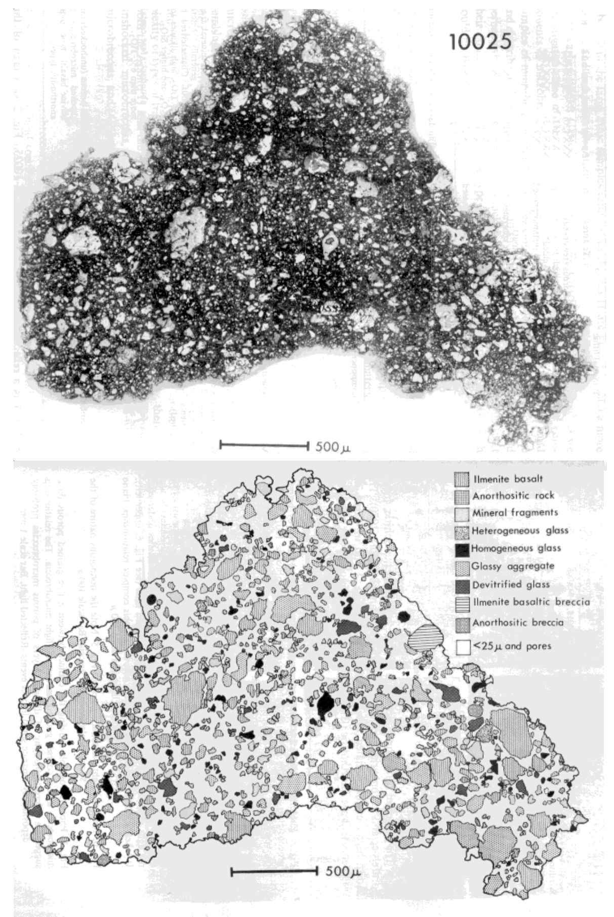
Figure 3: Photo and sketch map of thin section of 10025 (Chao et al. 1971).