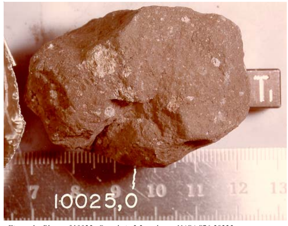
Figure 1: Photo of 10025. Sample is 5.5 cm long. NASA S76-28225.