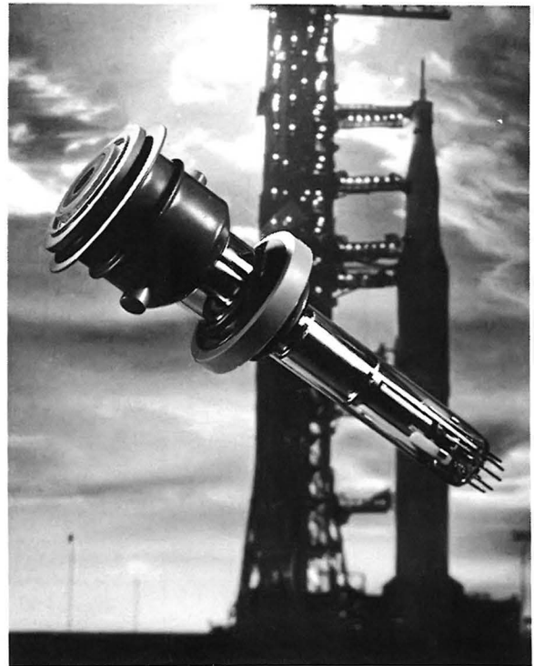
Burn-Resistant Camera Tube PR-29949

In such a case the target's temperature soars by as much as two million degrees Fahrenheit per second and burns out almost immediately. The new Westinghouse tube has a heat-resistant target much less susceptible