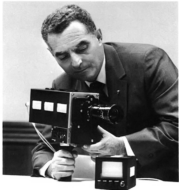
CM Camera with Mini Monitor PRX-29475-13

One unusual aspect of the color TV camera is that it employs only one imaging tube.