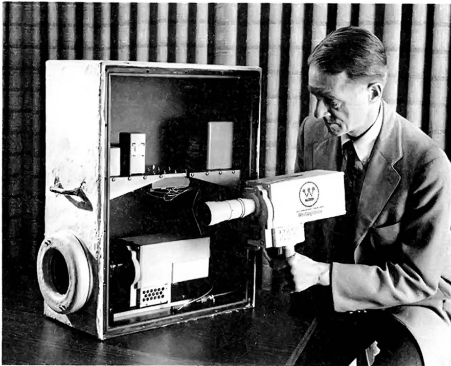
Lunar Surface Camera and Gantry Camera PRX-29944-12

called the gantry -- next to the rocket. Apollo-13 will be the first time such wide-angle, color closeups of the launch will be seen in a live broadcast.