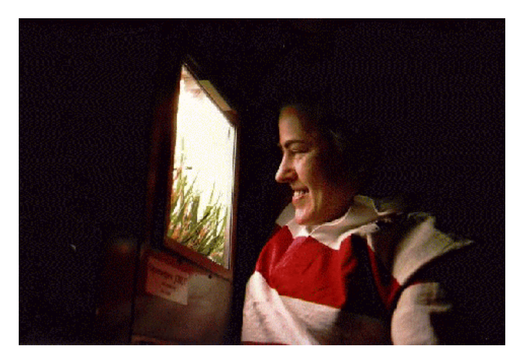
NASA 2 astronaut Shannon Lucid