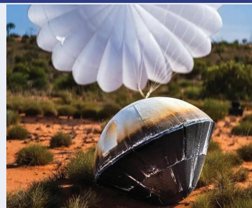
The Varda Space Industries W-5 capsule returned to Earth in Koonibba in South Australia, on Jan. 29, 2026, with the protection of a heat shield made of C-PICA, a cutting-edge material licensed from NASA and manufactured by Varda.