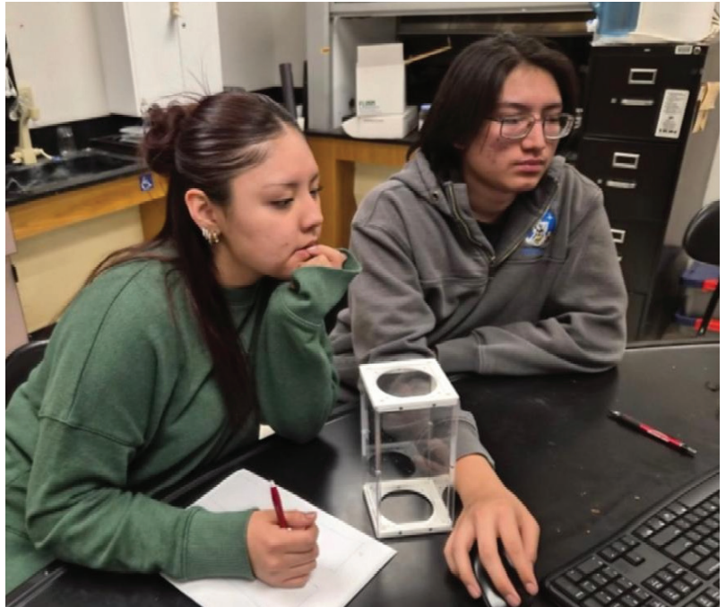
Winning team members from Mescalero Apache School in Mescalero, NM, work on building plans for their experiment.

Read about the winning teams and their experiments