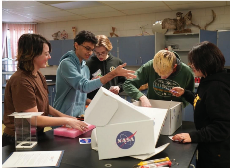
The winning team at Dickinson High School in Dickinson, ND unpack their NASA TechRise starter kit, which includes a flight box in which to build their experiment.