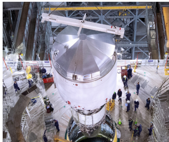
The Artemis II SLS ICPS mates with the launch vehicle stage adapter atop the SLS core stage in the vehicle assembly building at NASA's Kennedy Space Center in Florida. The ICPS will fire its RL10 engine twice to help send the Orion spacecraft to the Moon.