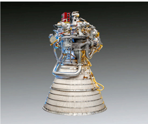
A single RL10 engine will provide nearly 25,000 pounds of thrust and serve as the main propulsion for the interim cryogenic propulsion stage (ICPS) that is flying atop the SLS (Space Launch System) Block 1 rocket in support of each of the first three Artemis missions.

SLS is the only rocket that can send Orion, crew, and supplies to the Moon in a single launch.