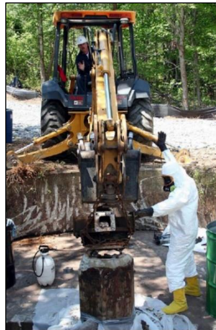
TCRA Mercury Removal

Remedial Investigation - In 2013, USACE completed a Remedial Investigation, which evaluated the sludge drying beds and extent of soil, sediment, groundwater, and surface water contamination, and assessed potential impacts to human health and the environment. Contaminants identified in the Old WWTP sludge (chromium, mercury, dichlorodiphenyldichloroethane (DDD), dichlorodiphenyldichloroethylene (DDE) pose an unacceptable ecological risk to birds and mammals (American robin and short-tailed shrew) that feed on soil invertebrates.