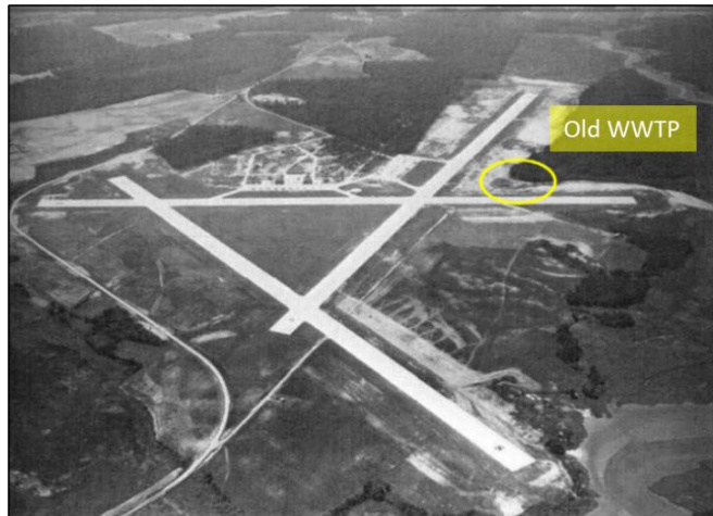
1943 Aerial Photograph with the Old WWTP

The Old WWTP included three cinderblock structures and a trickling filter. The cinder-block structures contained a control/pump house, process tanks (chlorine reaction tanks, primary and final settling tanks, and sludge digestion tank), and sludge drying beds. A comminutor building (grinding process) and valve house were located south of the cinderblock structures connected via a 10-inch diameter sewer line. The Navy built a second WWTP in 1954 and abandoned the Old WWTP in 1955. The DoD decommissioned CNAAS in 1959 and transferred the property to NASA on June 30, 1959. NASA has never used the Old WWTP since the transfer of facility ownership.