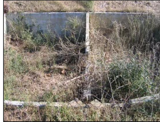
Sludge Drying Beds