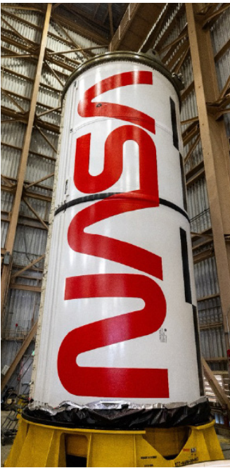
(Left) An Artemis II solid rocket booster motor segment inside the Rotation, Processing, and Surge Facility at NASA Kennedy.