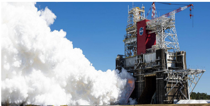
Artemis I core stage green run test in the B-2 test stand at NASA's Stennis Space Center in Bay St. Louis, Mississippi.

As part of the core stage test program, structurally similar versions of the core stage's intertank, engine section, and liquid oxygen and liquid hydrogen tanks were built and tested at NASA's Marshall Space Flight Center in Huntsville, Alabama, to ensure the stage could withstand the SLS flight environment. The completed Artemis I flight stage was put through functional testing at NASA's Stennis Space Center in Bay St. Louis, Mississippi.