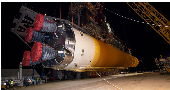
Artemis I core stage removal from B-2 test stand at Stennis following successful green run test.