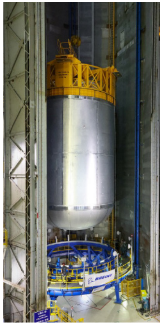
(Right) Crew lifts the Artemis III SLS core stage liquid oxygen tank into Cell D at NASA Michoud.

and produces a maximum of 3.6 million lbs. of thrust during launch. The design also includes new avionics, propellant grain design, and case insulation, and eliminates the recovery parachutes to allow greater payload to orbit.