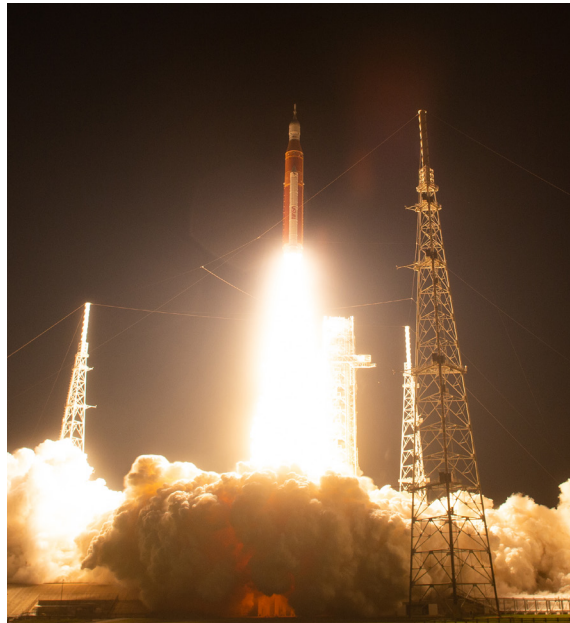
NASA's SLS (Space Launch System) rocket carrying the Orion spacecraft launches on the Artemis I test flight, Wednesday, Nov. 16, 2022, from Launch Complex 39B at NASA's Kennedy Space Center in Florida.

To fulfill America's future needs for deep space missions, SLS will evolve into increasingly more powerful configurations. Hardware is currently in production for the next three SLS flights, and development is underway on the more powerful