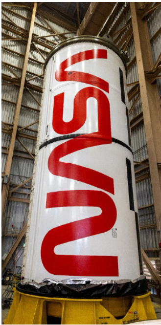
(Left) An Artemis II solid rocket booster motor segment inside the Rotation, Processing, and Surge Facility at NASA Kennedy.