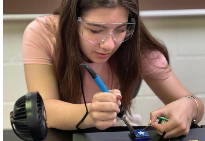
A NASA TechRise student team member focuses on soldering a microSD card breakout board component.

Pre-register now to receive challenge updates!