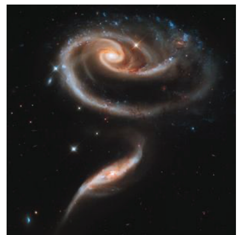
This Hubble Space Telescope image shows a pair of interacting galaxies, known as Arp 273.