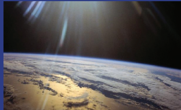
Sunlight reflects off the Indian Ocean in this view of Earth from orbit in late July 1985.

Have questions or topic suggestions for the discussion? Email us at: NASA-FlightOpportunities@mail.nasa.gov .