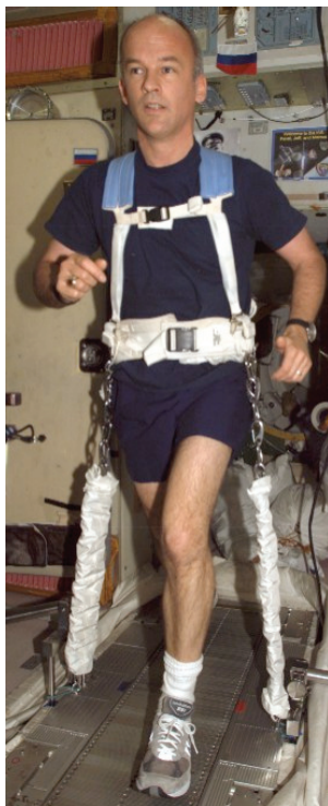
Astronaut Jeff Williams exercises on the ISS treadmill.