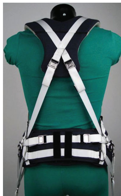
CSM harness designed to improve comfort, loading, and adjustability.