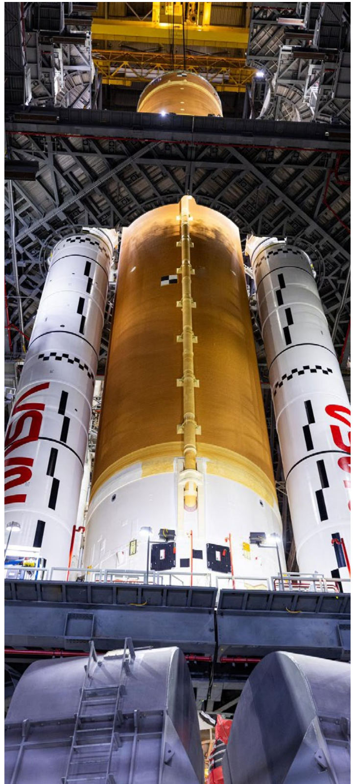
The SLS (Space Launch System) core stage for the Artemis II mission is mated with the solid rocket boosters in the Vehicle Assembly Building at NASA's Kennedy Space Center in Florida.