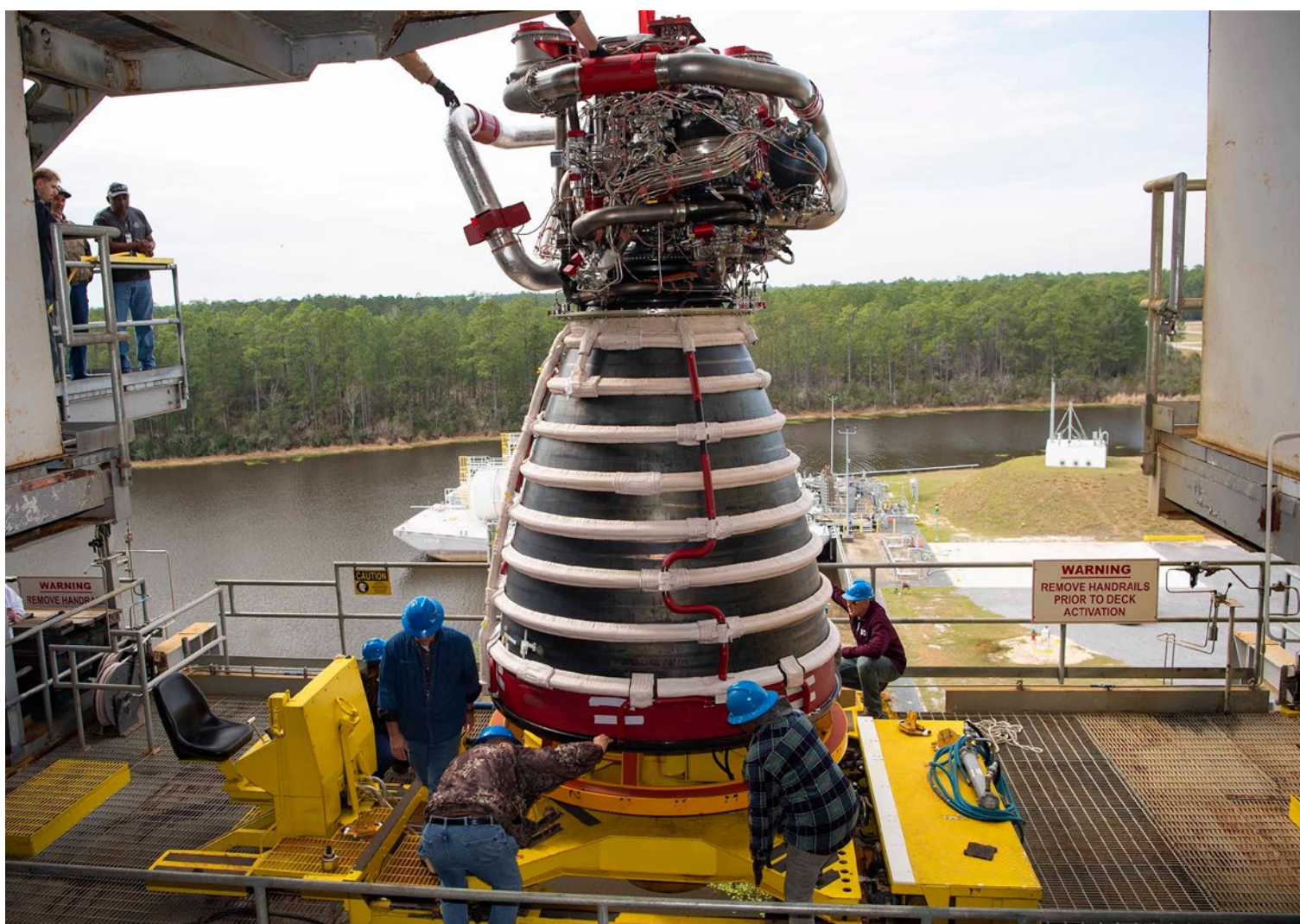
Teams at NASA's Stennis Space Center in Bay St. Louis, Mississippi, deliver, lift, and install the first new production RS-25 engine on the Fred Haise Test Stand on Feb. 18.