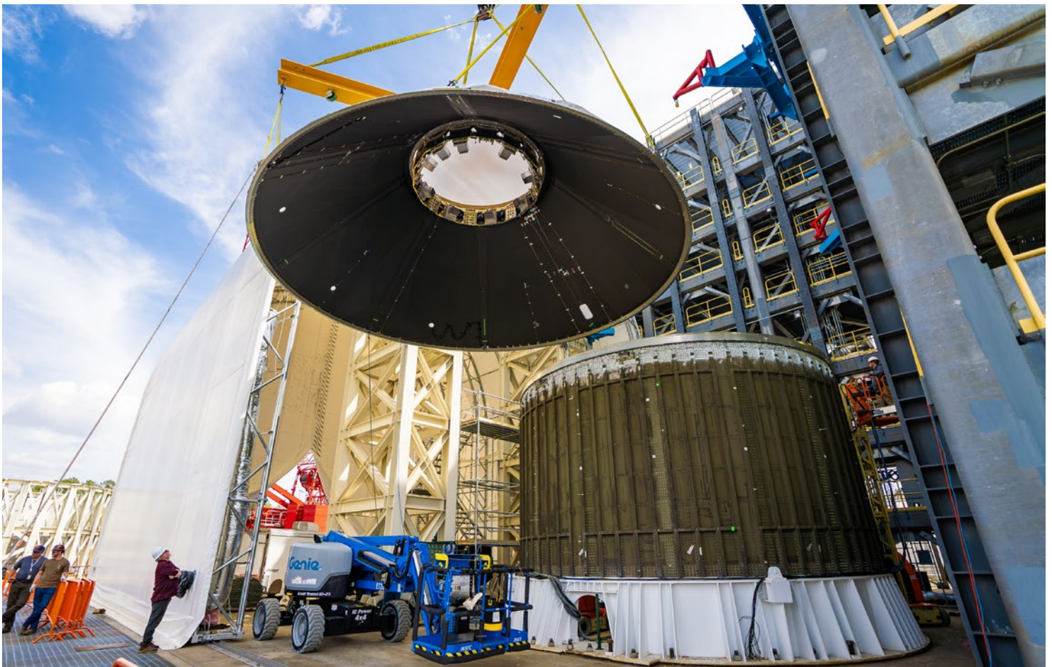
At NASA's Marshall Space Flight Center in Huntsville, Alabama, the payload adapter engineering development unit is installed into the 4697 test stand for structural testing. It is then attached to the large cylindrical structure which simulates the exploration upper stage interface.