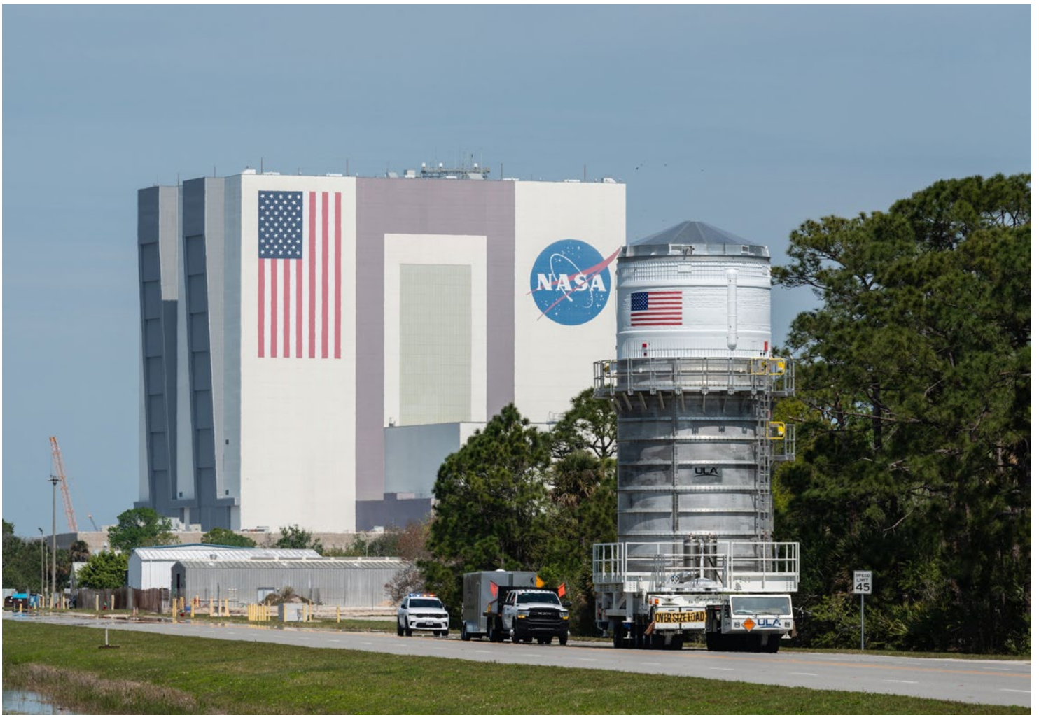
The Artemis II interim cryogenic propulsion stage is transported from ULA's facilities to NASA's Kennedy Space Center in Florida. The Vehicle Assembly Building, where SLS (Space Launch System) and Orion are stacked, can be seen in the background.