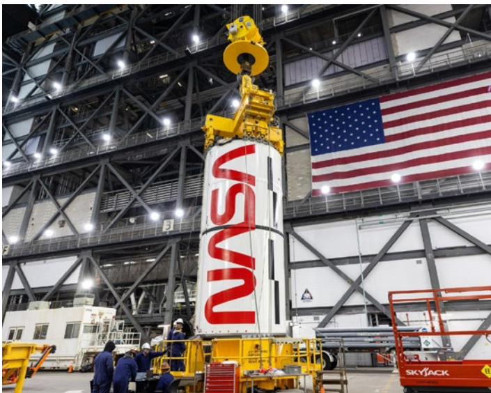
Engineers and technicians with NASA's Exploration Ground Systems Program prepare to lift the left center center booster segment shown with the iconic NASA "worm" insignia for the agency's SLS (Space Launch System) rocket in the Vehicle Assembly Building at NASA's Kennedy Space Center in Florida in January.

go.nasa.gov/3GaOnnB and go.nasa.gov/4iriBQK