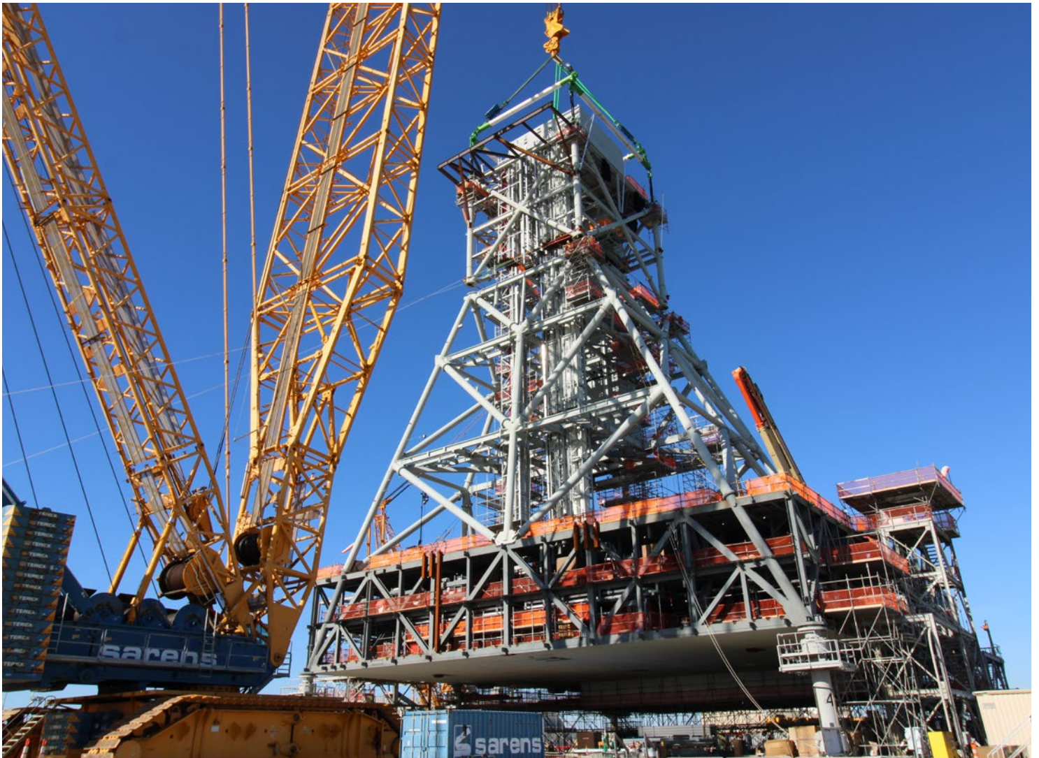
Teams at Bechtel National, Inc. use a crane to lift Module 4 into place atop the mobile launcher 2 tower chair at its park site on Jan. 3, 2025, at NASA's Kennedy Space Center in Florida. Module 4 is the first of seven modules that will be stacked vertically to make up the almost 400-foot launch tower that will be used beginning with the Artemis IV mission.