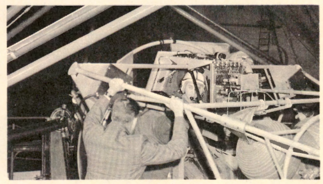
Grissom is strapped into couch.