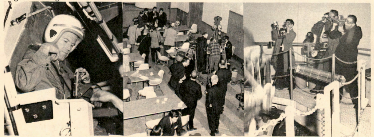
Cooper in gimbal rig.