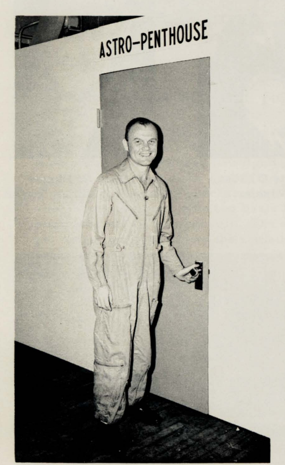
Astronaut John H. Glenn, Jr. leaving the ready room for disorientation tests in the gimbal rig.

In the spin-test program, each astronaut experiences 4\frac{1}{2} to 5 hours of flight time in the MASTIF. During this time they learn to orient the simulated space capsule while rotating in each of the three axes individually and in combination.