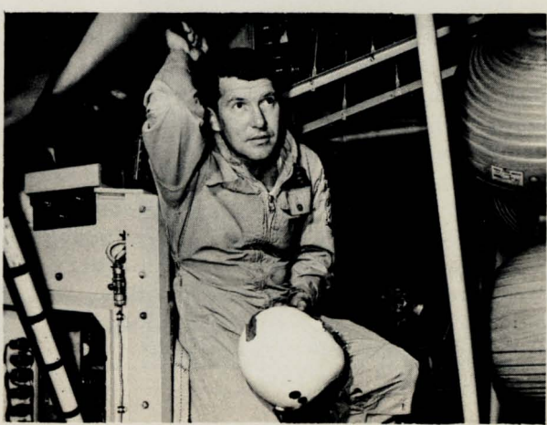
Astronaut Walter M. Shirra, Jr. climbing out of the gimbal rig couch after spin tests.