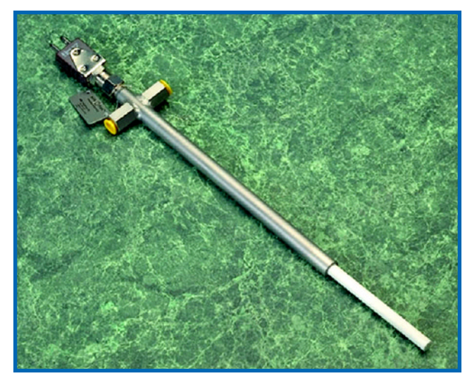
Figure 1.—High-temperature ceramic sheath inserted into a high-temperature metal support section.

The ceramic portion of the probe is inserted into the hot area of interest, while the metal support and the fiber optic would be in a cooler area. The length of the ceramic sheath and metal support for a specific probe would be designed based on the dimensions of the intended application. Since the inside and outside temperatures of the ceramic sheath are nearly the same, using multiwavelength pyrometry to measure the inside temperature of the sheath in an effective way to capture the temperature of interest. As the ceramic heats up, it emits black body radiation, which is detected by the fiber optic. The fiber-optic signal is transmitted to a spectrometer where the temperature of the ceramic tip is determined.