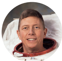
Michael E. Fossum