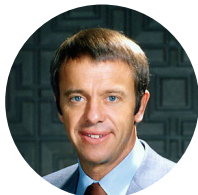
Alan B. Shepard, Jr.