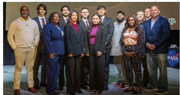
Texas A&M University