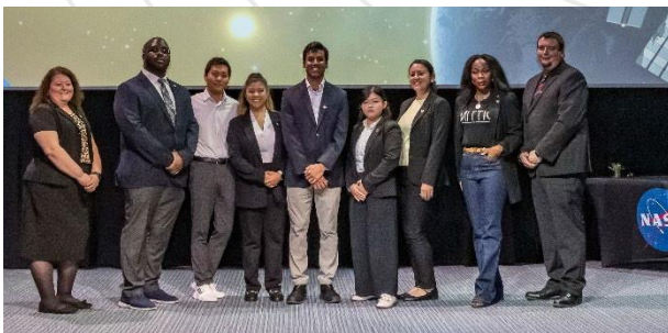
University of Houston-Clear Lake