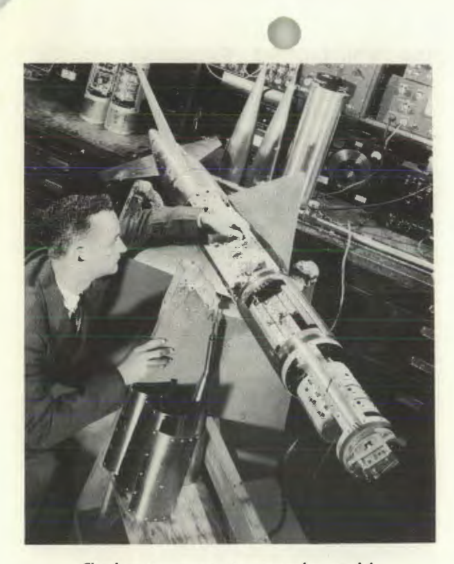
Checking instrumentation in rocket model

which of course must be in usable form, are correct.