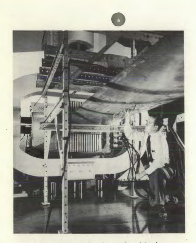
Thin wing tested under combined loads

strength of a structural member may be weakened by seemingly minor discontinuities like machining grooves, rivet holes, and small changes in crosssectional dimension.