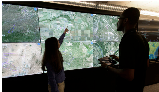
In early 2016, NASA and operators from the Federal Aviation Administration's six drone test sites across the country flew multiple drones simultaneously to test rural operations of NASA's traffic management research platform.

While negotiating additional arrangements, NASA already has a large number of partner agreements on UTM research in place. To view this list go to: www.nasa.gov/aeroresearch/programs/aosp/saso/partners .