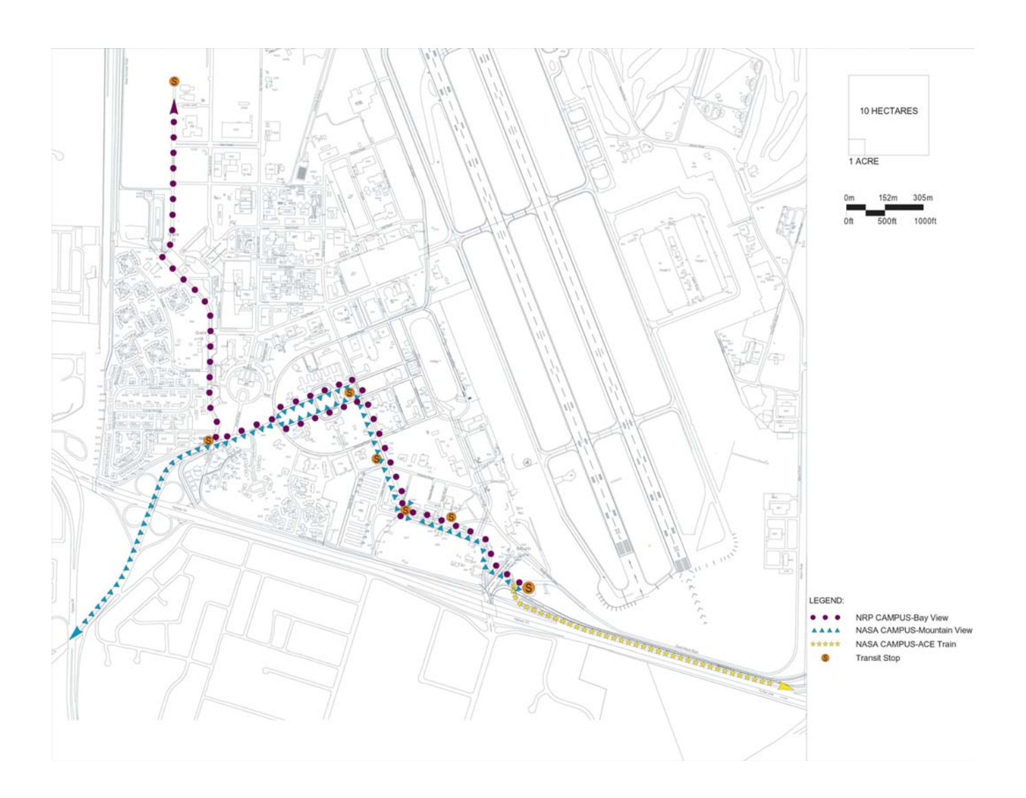
Figure 4-2: Conceptual Shuttle System – Weekday Service