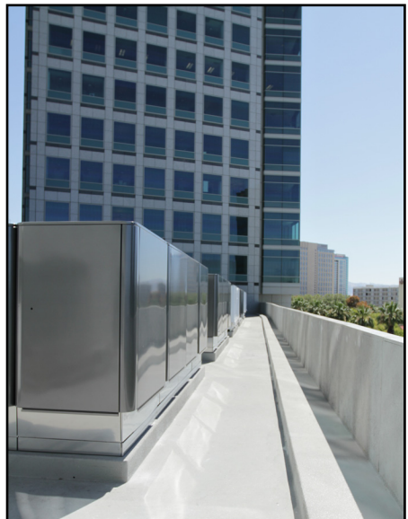
The new Bloom Boxes

The company is also hiring and has more than 500 employees, up from about 300 in February.