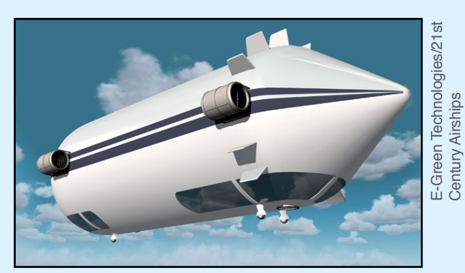
Artist Rendering of EGT Airship Bullet™ Class 580 in flight: Sightseeing/Rear left view (2010)

For future SVSBR events and membership information, please visit: www.svsbr.org