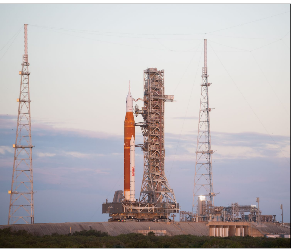
NASA's Space Launch System rocket atop mobile launcher 1 on Launch Pad 39B at Kennedy Space Center in Florida, prior to the launch of Artemis I.

Total height above ground: 402 ft Tower: 40 x 50 ft square, about 377 ft tall Approximate weight: 12.4 million lbs