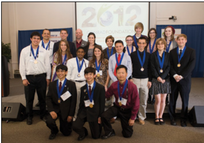
The 2012 Conrad Awards were held at the Moffett Field Conference Center, NASA Research Park, Moffett Field, CA on March 31.