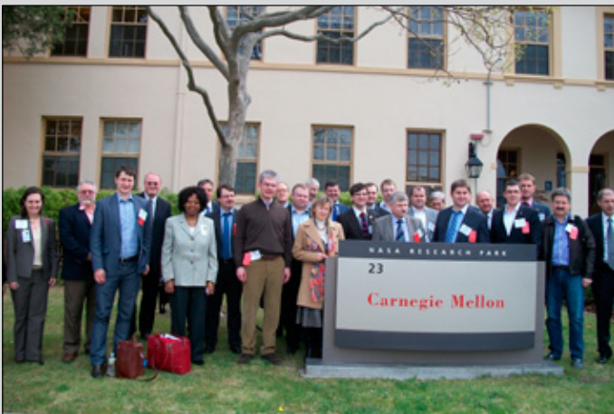
US-Russia Bilateral Commission Innovation Working Group visited NRP on March 26, 2012.