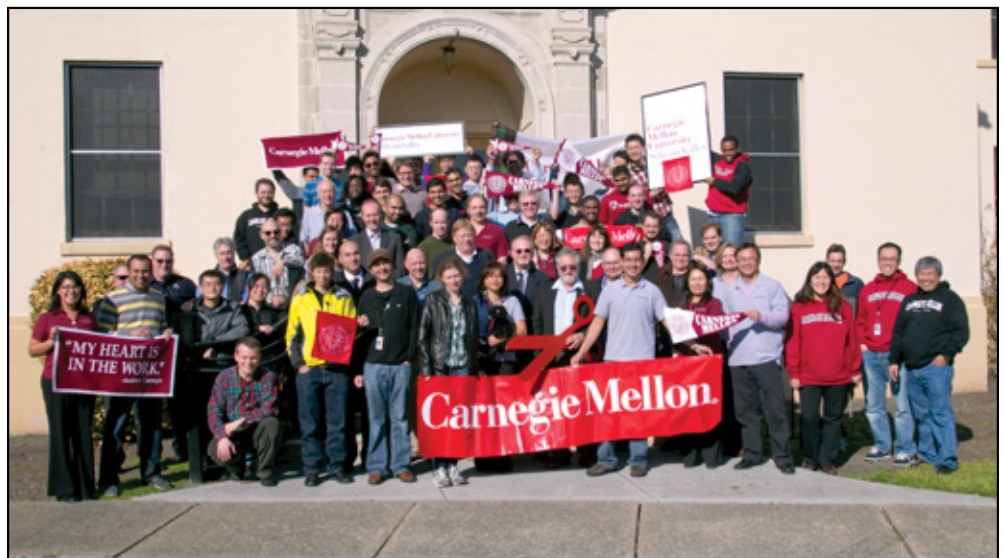
CMU-SV continues their campus expansion in NASA Research Park, adding 6,406 s.f. in Bldg. 19 on March 1, 2012. Over the last 6 months they have acquired 12,418 total s.f. in Bldg. 19.