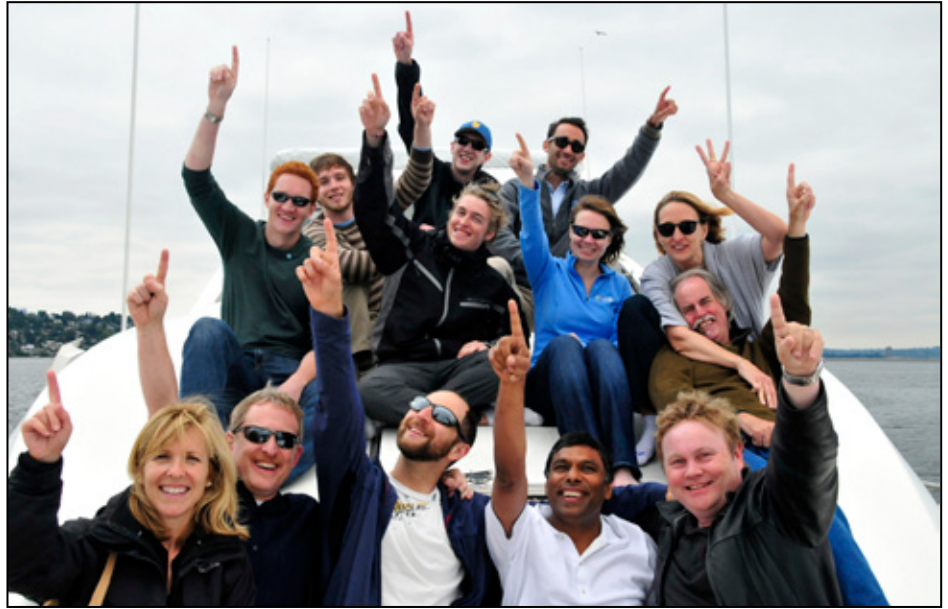
The Moon Express team

Silicon Valley-based Moon Express was one of only three U.S. companies awarded the first $500K Task Order under NASA's ILDD program. Successful completion of the newest task order will bring the company's ILDD awards to $610,000. Although an important substantiation of NASA's interest in commercial lunar providers, the ILDD contract represents a fraction of the investment needed to execute a commercial lunar mission. The majority of Moon Express funding is coming from private investors and is supplemented by revenues from payload customers.