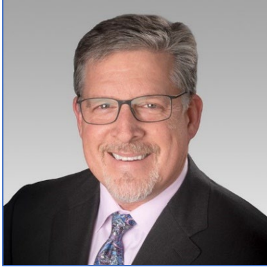
David A. Kaufman, Ph.D. President, Ball Aerospace

Ball Aerospace is a U.S. manufacturer of spacecraft components and instruments for commercial, civil, and national security space missions. Ball Aerospace designed and manufactured the optical subsystem, which includes the 18 gold-plated hexagonal primary mirror assemblies, for the James Webb Telescope.