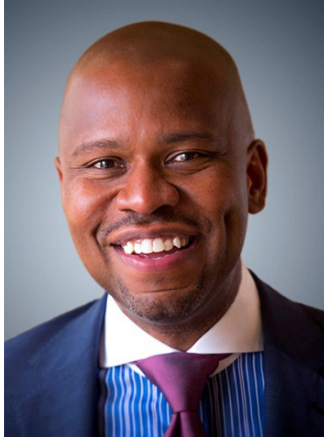
Mr. Theodore “Ted” Colbert CEO, Boeing Defense, Space & Security

Boeing develops and operates space systems across all sectors – civil, national security, and commercial. This includes the soon-to-launch Space Launch System that will launch astronauts to the Moon as the rocket for NASA’s Artemis mission, the Starliner which will transport astronauts to/from the International Space Station (ISS), and the X-37B spaceplane.