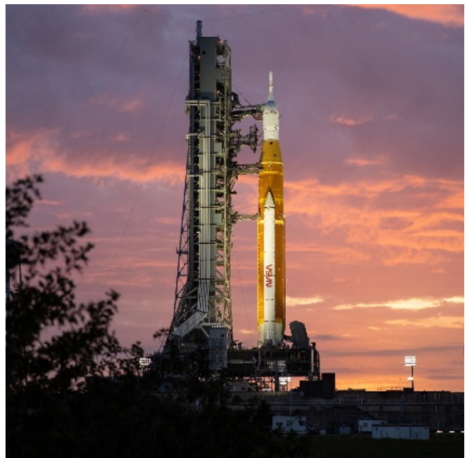
Figure 2. Artemis I at Launch Pad 39B.