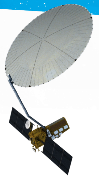
NI SAR. NASA Science

The Science Activation (SciAct) projects are guided by independent evaluators and work toward reaching specific underserved audiences based on specific needs. Evaluation data helps to identify barriers to accessing and using scientific data and validate strategies that reduce these barriers so that NASA can empower individuals to play an active role in addressing issues of importance to them.