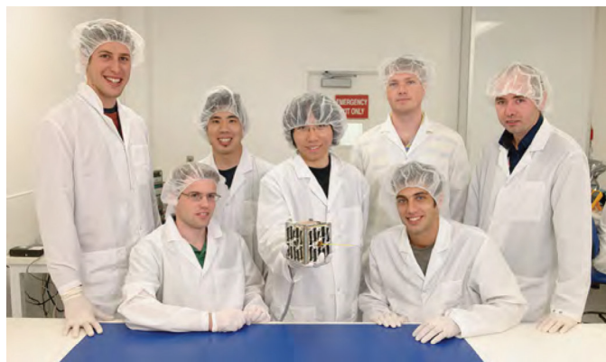
The PhoneSat Design and Integration Team at NASA Ames Research Center

Spacecraft Technology Program (SSTP), one of nine programs within NASA's Space Technology Mission Directorate, and the Engineering Directorate at NASA Ames Research Center. The SSTP develops and matures technologies to enhance and expand the capabilities of small spacecraft with a particular focus on communications, propulsion, pointing, power, and autonomous operations. The PhoneSat project started in Summer 2009 as a student-led collaborative project between NASA Ames and the International Space University, Strasbourg.