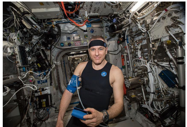
Using blood pressure monitor on ISS

Body Impedance: Guidance is provided to determine the appropriate body impedance for calculating the associated voltage with a given current threshold.