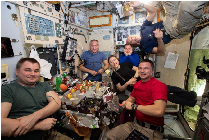
Members of Expedition 60 crew gather together for dinner inside the galley of the Zvezda service module.