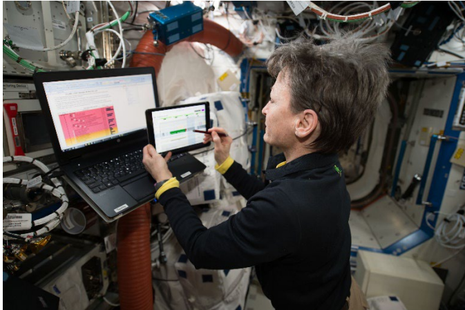
NASA astronaut Peggy Whitson completing Crew Autonomous Scheduling (CAS) test sessions to schedule future workday.