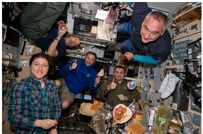
Expedition 60 crewmembers gather inside the Zvezda service module's galley for dinner on the ISS.