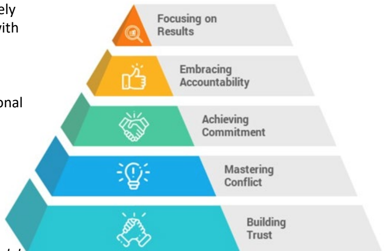
The Five Behaviors of a Cohesive Team Model

Soyuz TM2-Mir: Evacuation with interpersonal conflict as a primary contributing factor.