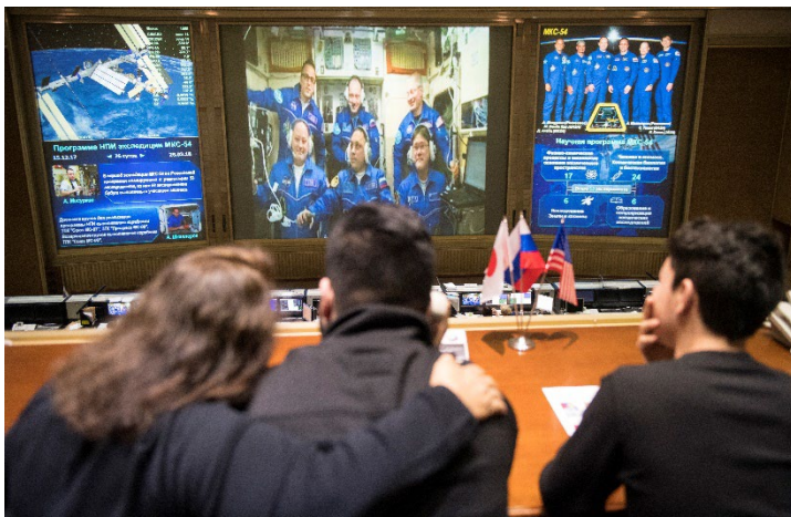
NASA astronauts Scott Tingle, Joe Acaba, Alexander Misurkin, and Mark Vande Hei; Anton Shkaplerov of Roscosmos; and Norishige Kanai of the Japan Aerospace Exploration Agency (JAXA), are seen on a video monitor as they speak with family and friends at the Moscow Mission Control Center in Korolev, Russia a few hours after the Soyuz MS-07 docked to the ISS.