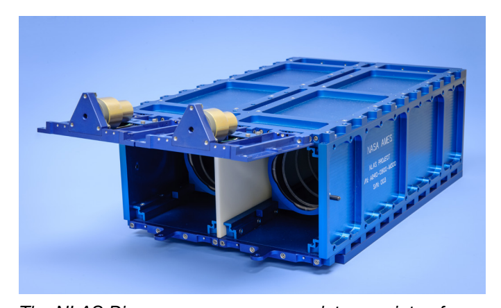
The NLAS Dispenser can accommodate a variety of nanosatellites or CubeSats including 1U, 1.5U, 2U, 3U and 6U CubeSat form factors. A single NLAS Dispenser can deploy secondary payloads up to 26 pounds (12 kg) in 3U configuration and 30 pounds (14kg) in 6U configuration.