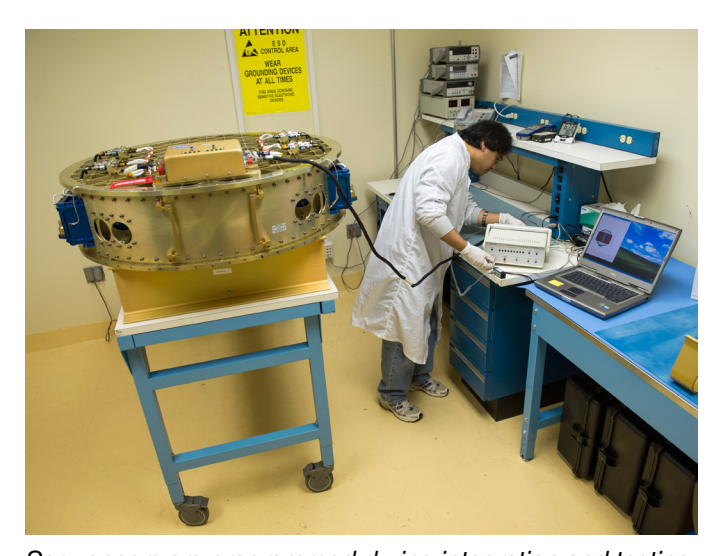
Sequencers are programmed during integration and testing.

NLAS builds upon past mission successes and technologies developed at NASA Ames Research Center, Moffett Field, California. NLAS is used by NASA, other government agencies and commercial entities. NLAS Dispensers and Sequencers flew in November of 2013 successfully commanding the deployment of 26 CubeSats. NLAS is slated for flight in late 2015.