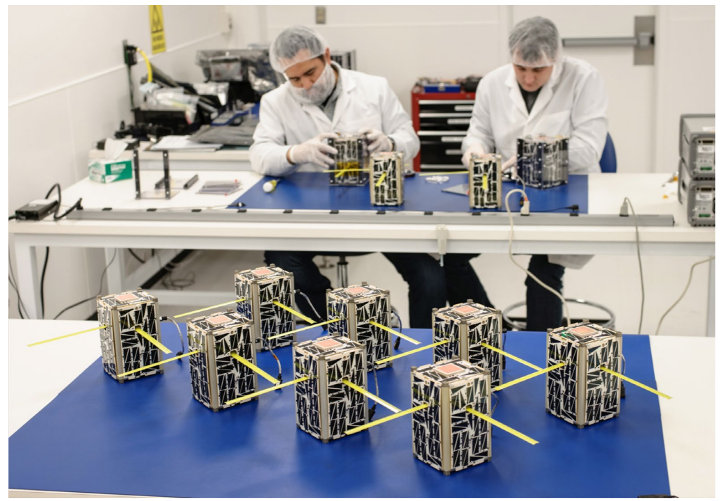
Completed EDSN Flight Units with Engineers Inspecting EDSN Flight Spares