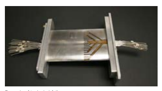
Example of typical airfoil.

for the NACA's worldwide reputation in aerodynamics. The data from the LTPT were cataloged by Abbott and Von Doenhoff in a publication that became the "bible" of airfoil information for future generations in the aeronautics community.