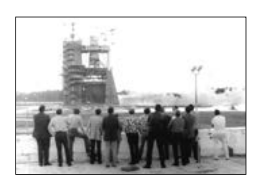
Eleven months after the Mississippi Test Operations became the National Space Technology Laboratories, the first static test-firing of the Space Shuttle main engine on the A-1 Test Stand was conducted on 19 May 1975.

Nearly one year to the day after Fletcher's announcement, the first Space Shuttle main engine achieved ignition, marking the beginning of more than 30 years of successful Space Shuttle main engine testing by the site.