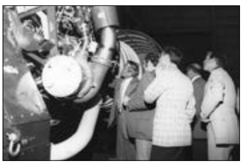
Visitors from Huntsville, Alabama, view the first Space Shuttle main engine in NSTL Building 3202. The first Space Shuttle main engine achieved ignition on 12 June 1975 and was fired for a full duration, without an early shutdown, on 24 June.