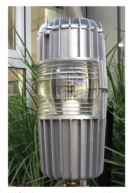
NASA Ames recently opened N232 Sustainability Base, a collaborationenhancing facility where the Center will hone technology useful in a lunar base. "Native to Place" design principles intersect with NASA's expertise of in situ resource utilization to produce a highperforming building that strives to lead and model resource efficiency within the federal government. Reflecting the "reduce and reuse" mantra driving the design of the building, explosionproof emergency lamps that once graced Hangar One and that nicely complement the architecture of this new green building were installed as safety lamps.