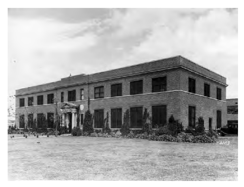
The Administration Building as it appeared in 1930. The computer pool was housed in this building.

could finish in a day. While the initial computer pool at Langley proved a success, what really drove the expansion of computing (and the expansion of Langley overall) was the United States' involvement in World War II.