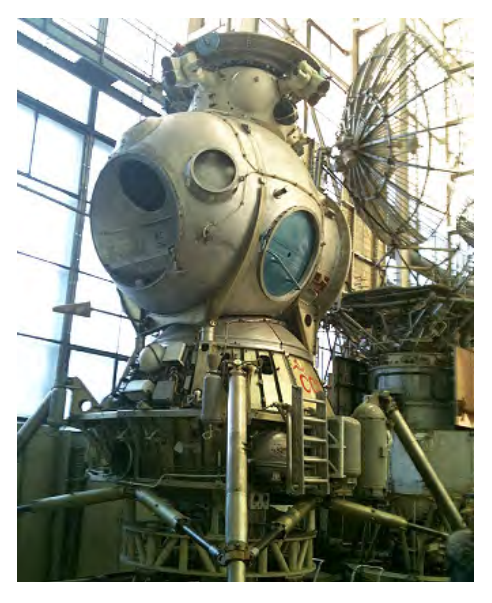
The Soviet Lunar Ship at the Moscow Aviation Institute.