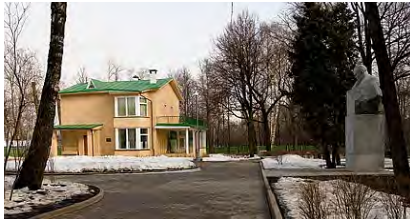
The Korolev House Museum. This museum, run by a close friend of Korolev's late second wife, is separate from the Academician S. P. Korolev Memorial Apartment Museum.