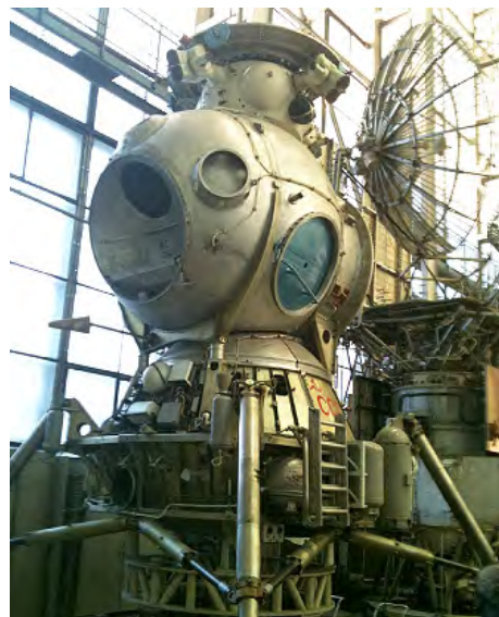
The Soviet Lunar Ship at the Moscow Aviation Institute.