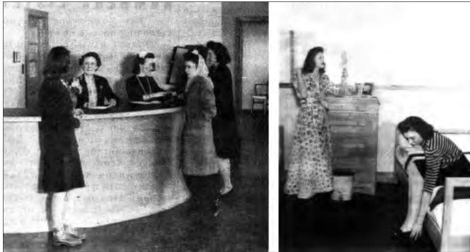
NACA women moved into Anne Wythe Hall in December 1943. The temporary dormitory complex provided housing to single, female government workers. (Source: Langley Bulletin , vol. 2, no. 32, November/December 1943)

reported several new housing opportunities in 1942 and 1943. Besides a new subdivision that was to be an “ideal situation because it is possible to establish a new community made up entirely of NACA employees,” 1 and several rooms and apartment complexes available for the men, a new dorm was opened exclusively for women. Anne Wythe Hall was a temporary federal housing complex for female government workers. The first 372 units were opened in the summer of 1943. Rent included access to the laundry room and large bathroom on the first floor, as well as three warm blankets per resident. The residents were welcome to entertain their callers in the large lounge in the Community Building. Although there was not a curfew, the house mother locked the doors at 11 p.m. as “protection against prowlers.”