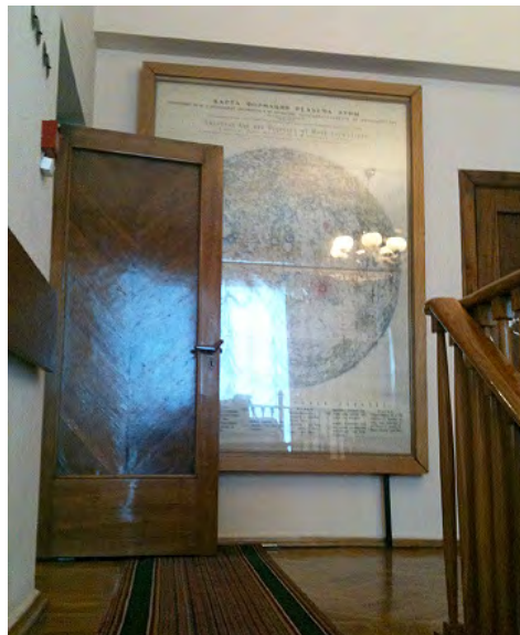
Map of the Moon outside Chief Designer Korolev's home office.