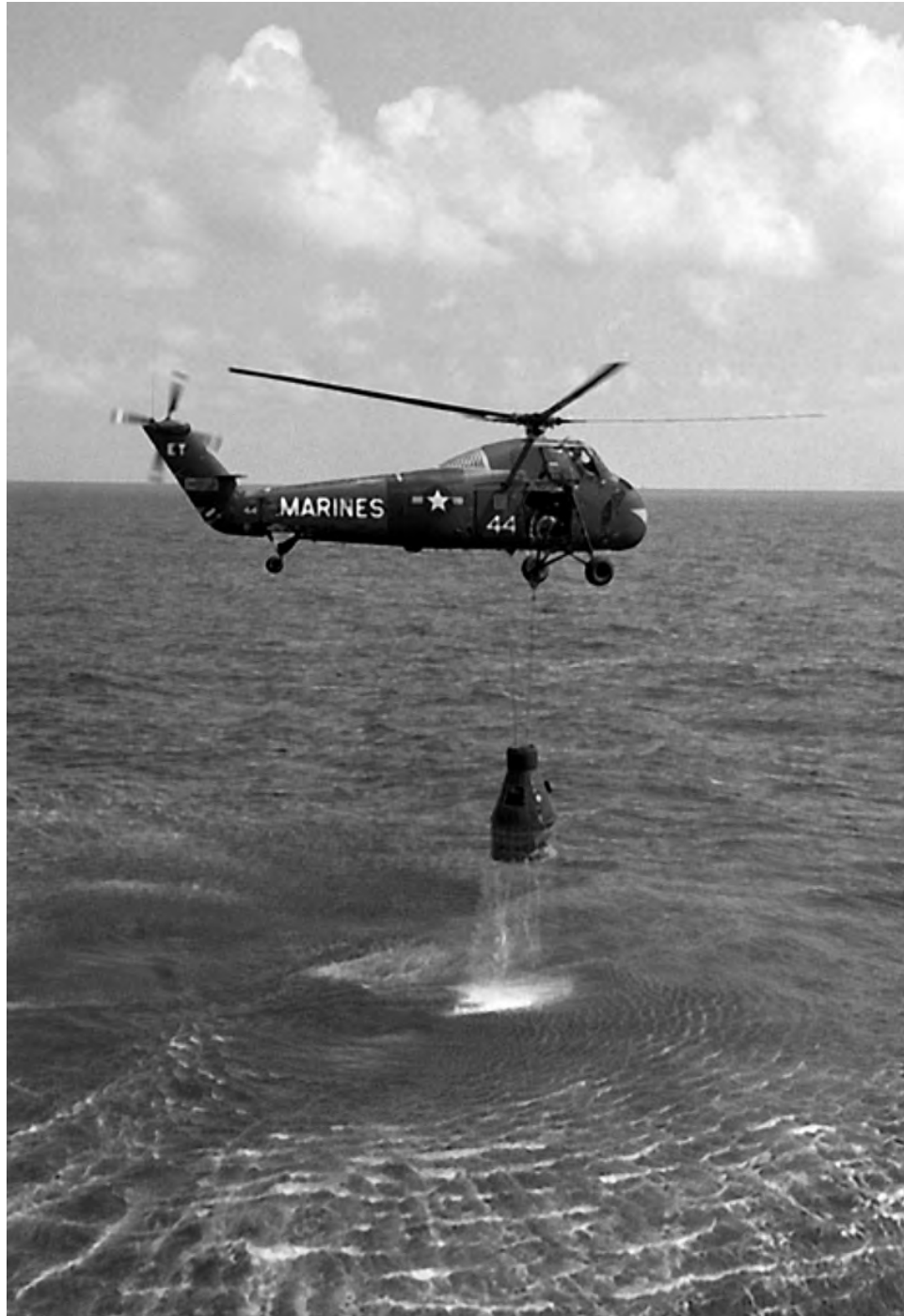
On 5 May 1961, Alan B. Shepard, Jr., flew successfully in space for 15 ½ minutes and returned safely. Although Yuri Gagarin had already made his orbital spaceflight on 12 April 1961, Shepard became the first American in space. This image shows a U.S. Marine helicopter recovering the Freedom 7 capsule from the Atlantic Ocean.