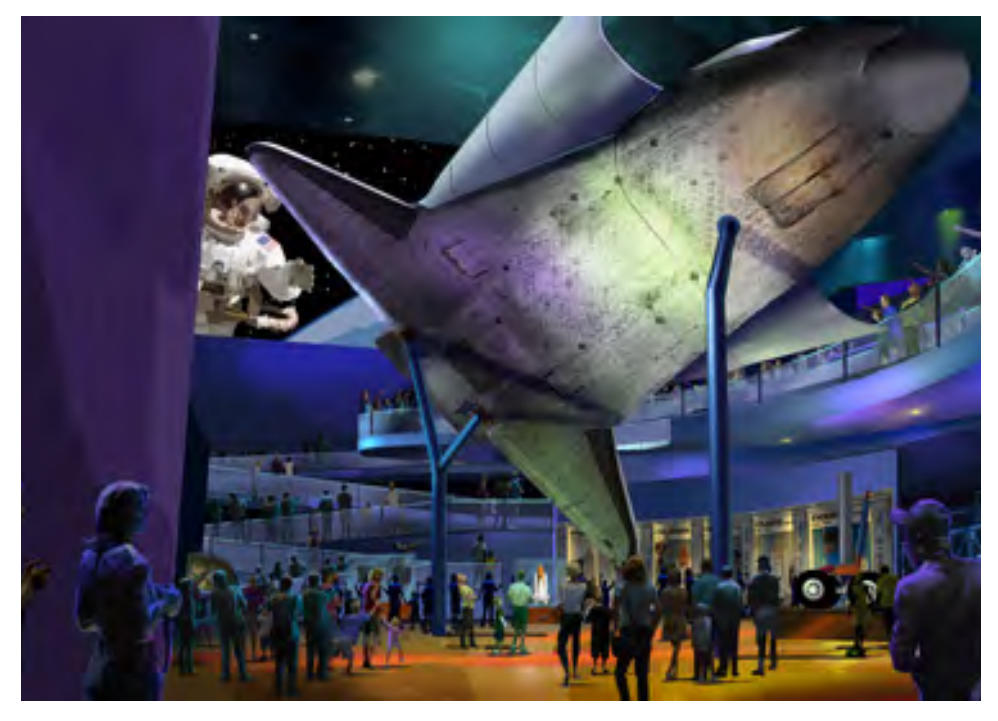
Perspectives on the Shuttle Program (continued)