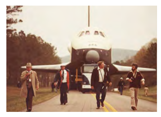
In 1978, Enterprise arrived at Marshall for vertical ground-vibration testing.