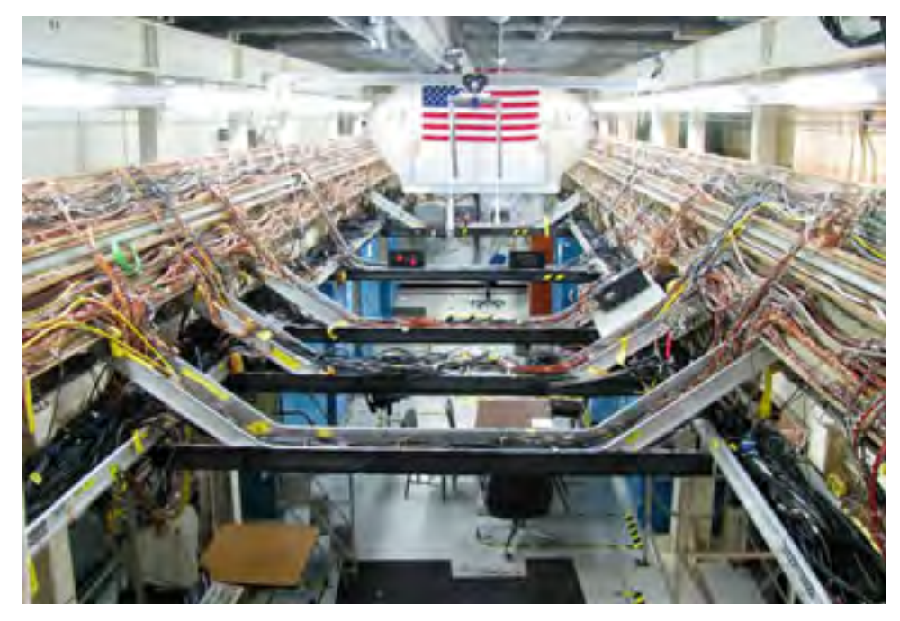
The midfuselage/payload bay area of OV-095 in SAIL.

its next assignment, supporting the Orbital Flight Test (OFT) program utilizing Columbia . Each time the development of the Space Shuttle advanced, SAIL was updated accordingly.