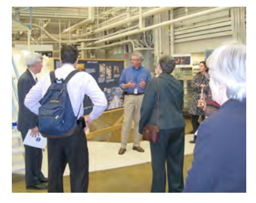
The attendees explore the Zero G Facility, the world's largest facility that provides ground-based microgravity research.