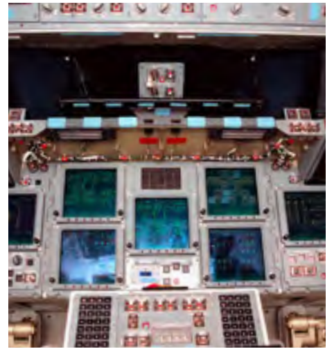
The "glass cockpit" on Space Shuttle Atlantis.