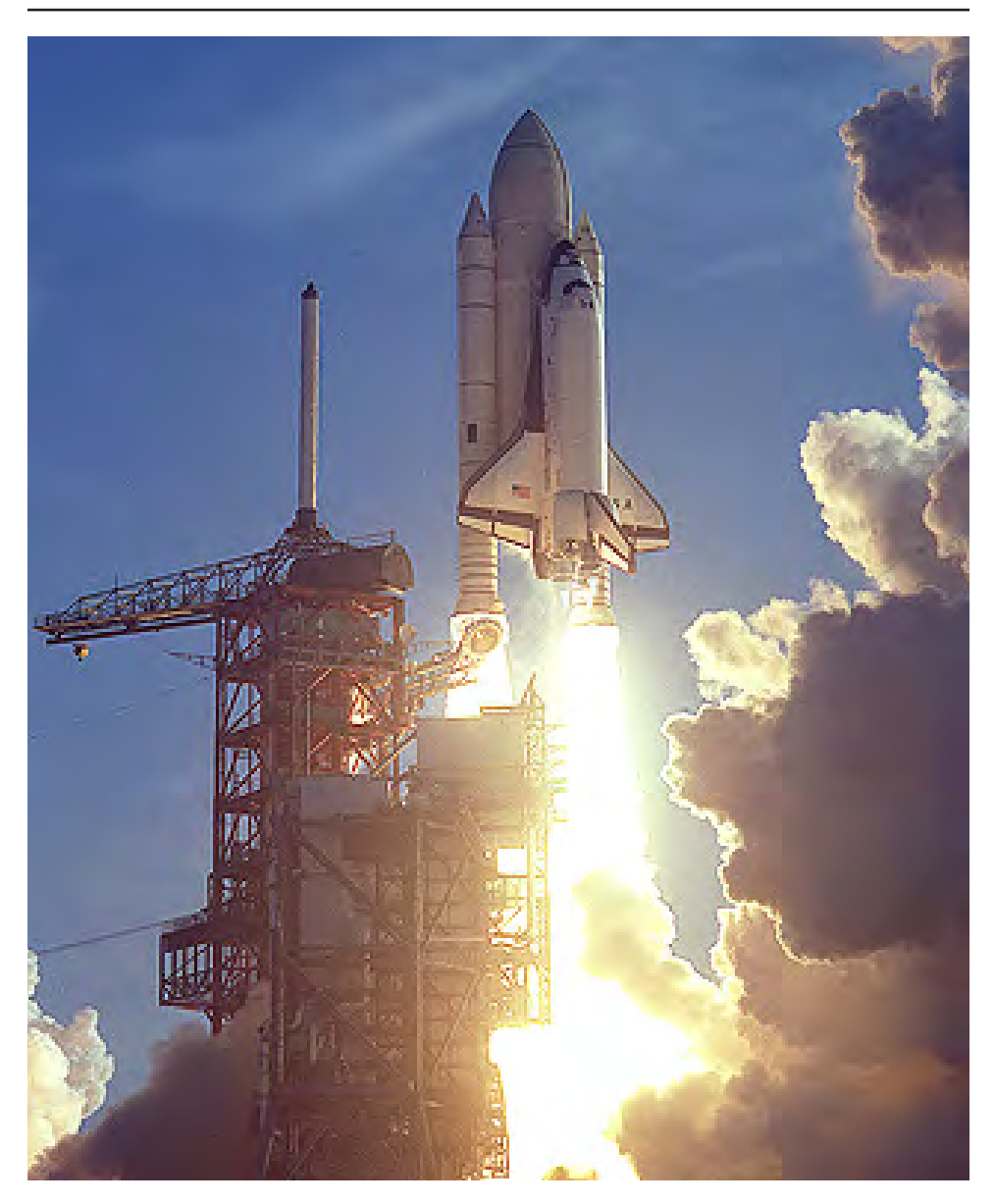
On 12 April 1981, Columbia officially launched the world's first reusable Space Transportation System into orbit, with John Young and Bob Crippen on board. The STS-1 crew tested the new spacecraft during 36 orbits around Earth and landed at Edwards Air Force Base in California nearly 55 hours later.