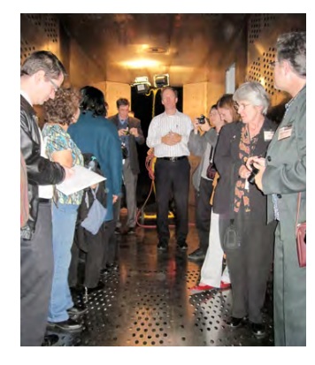
The 8' x 6' Supersonic Wind Tunnel serves as NASA's only transonic-propulsion wind tunnel, which has been in operation for over 60 years.