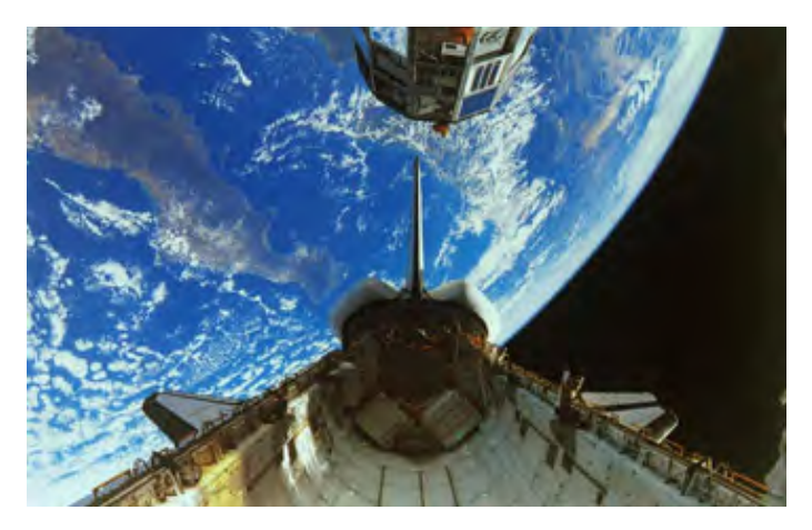
Space Shuttle deploying LDEF.