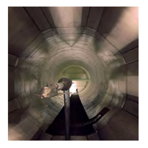
Model of the Space Shuttle in Langley's 16-Foot Transonic Tunnel.