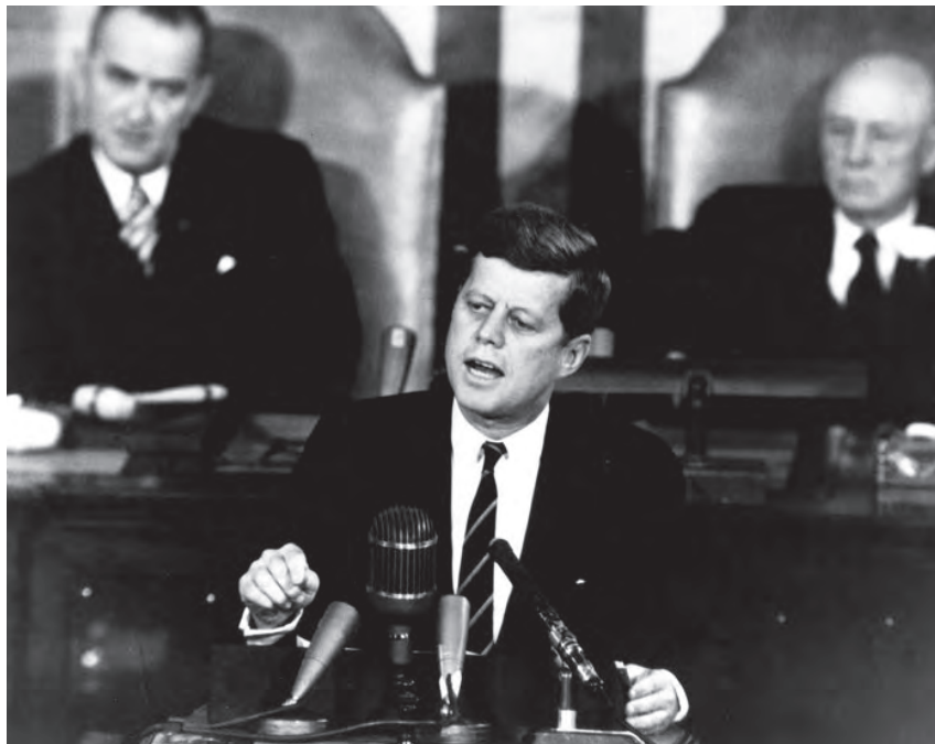
President John F. Kennedy (center), Vice President Lyndon B. Johnson (left), and Speaker of the House Sam T. Rayburn (right).

On 25 May 1961, President John F. Kennedy delivered his “Special Message to the Congress on Urgent National Needs” speech before a joint session of Congress, stating: