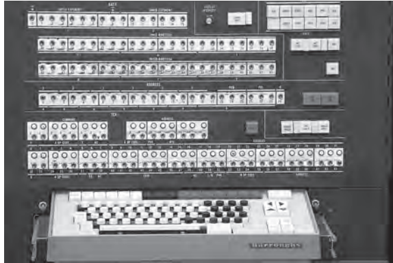
The Computer History Museum opened its new exhibit Revolution: The First 2000 Years of Computing . Among the artifacts prominently woven into that history are the ILLIAC IV massively parallel supercomputer, the Apollo Guidance Computer, and the SGI IRIS workstation for which NASA Ames was the launch customer.