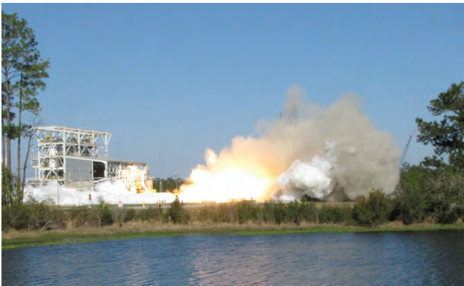
A team of engineers from NASA's John C. Stennis Space Center, Orbital Sciences Corporation, and Aerojet conducts a successful test of an Aerojet AJ26 rocket engine on 19 March. Stennis is testing AJ26 engines for Orbital Sciences to power commercial cargo missions to the International Space Station.

The initial two engines will be delivered to Orbital at the Wallops Flight Facility launch site in Virginia for integration with the Taurus II's first-stage core.