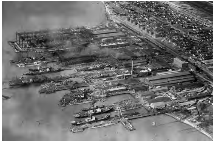
Figure 4. Aerial view of the shipyard taken in March 1920. The machine shops are located at the middle right of the photograph.