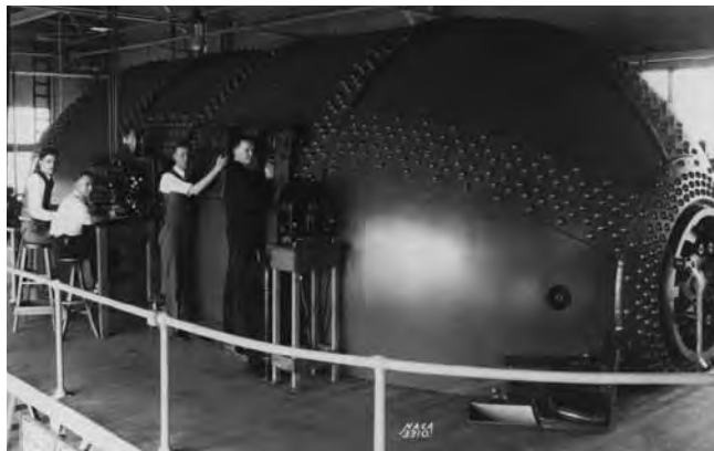
Figure 1. The VDT during a research study in 1929.

The fact that the 85-ton pressure shell was fabricated at the Newport News Shipbuilding and Drydock Company during 1921 and 1922 is well known; however, the description of how the shell was transported to Langley for installation in what is currently NASA Building 582 (then NACA Building 60A) in the NASA East Area has been erroneously reported by NASA for over 30 years. The following