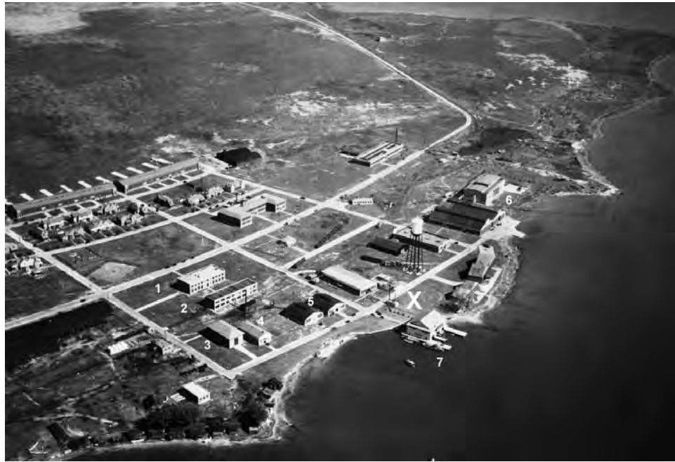
Figure 8. Aerial view of Langley Field in 1928 showing location of major NACA facilities and the probable location of the tank in figure 7.

photograph near the water tower. Shown are 1) the NACA Administration Building, 2) the NACA Service Building, 3) Wind Tunnel No. 1, 4) VDT Building 582, 5) the NACA aircraft engine research buildings, 6) the Propeller Research Tunnel, and 7) the Langley Officers Club. The “X” denotes the probable site of the previous photograph. How the tank was transported from its arrival site to Building 582 is not known.