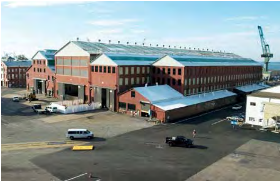
Figure 3. View of the massive 120-year-old machine shop buildings at Northrop Grumman Shipbuilding in Newport News.

Michael Dillard, the current photo library editor of Northrop Grumman Shipbuilding, recognized the shipyard building in the background and has provided valuable support for this study with several photographs from the files of the shipyard. Figure 3