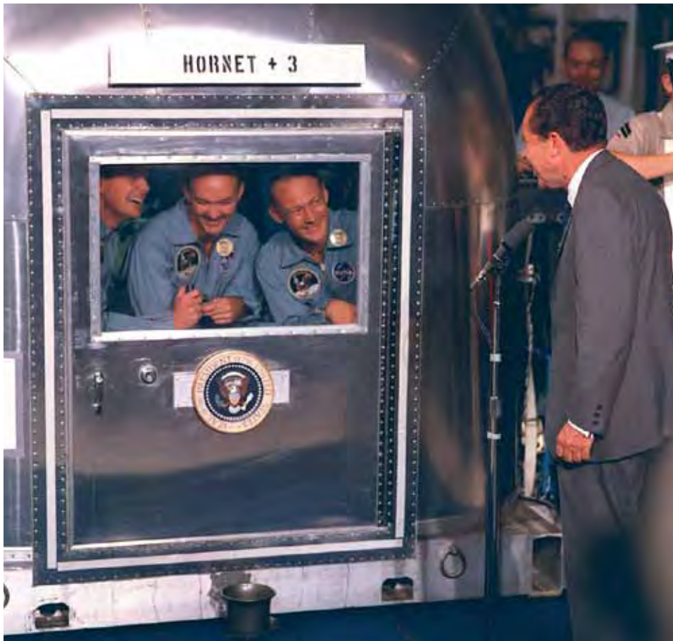
President Richard Nixon smiles at the Apollo astronauts in quarantine after returning from the Moon.

spacecraft, the book traces the methods for drastically reducing microbe counts. When Biospheres Collide returns to the subject of Mars exploration later in the book, recounting how missions of the 1990s and 2000s handled their planetary protection challenges. These missions were launched as a mélange of different extremophile organisms were being discovered in the most hostile places of Earth, such as in volcanic vents and deep under Antarctic ice. These discoveries demonstrated that life could find ways of surviving even the most hostile conditions on our planet and maybe even the environments of other planets as well.