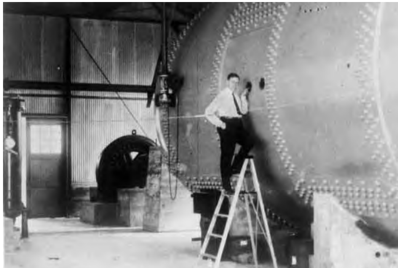
Figure 9. Dr. Max Munk, the famed inventor of the VDT concept, inspects the tank after it was mounted on concrete pads in Building 582. Dr. Munk has turned toward the front of the building facing the Back River. The photograph was probably taken in the summer of 1922, but the specific date indicated (6/1/1922) is questionable.