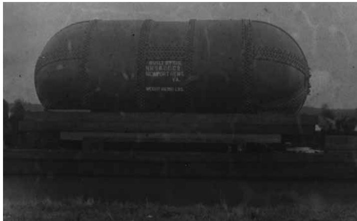
Figure 5. Arrival of the pressure tank of the VDT at Langley via barge in June 1922.