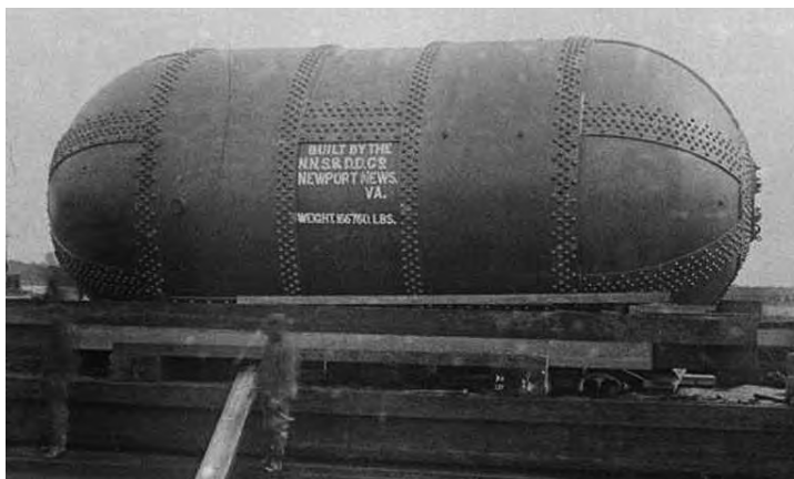
Figure 6. The tank barge docks at Langley.