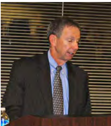
NASA Administrator Michael Griffin addresses reception attendees.