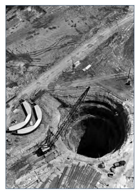
Construction of the B-2 site required the excavation of a 180-foot-deep hole, pictured here in 1965.

Although GRC had already expanded its original aeronautics capabilities and was directly supporting NASA's space missions, construction of the B-2 site and the Space Power Facility (constructed at the same time) expanded GRC's contribution to space exploration. The B-2 site directly contributed to the success of the U.S. space program, earning it the designation of a National Historic Landmark in 1985. The B-2 test facility was nominated to the National Register of Historic Places as part of the Man-in-Space NHL Theme Study conducted by the National Park Service. It was one of three sites grouped as Rocket Engine Development Facilities. Along with the Rocket Engine Test Facility and the Zero-Gravity Research Facility, the nomination states that these sites represent the "important role of the Lewis Research Center in developing hydrogen as a fuel for Centaur and Saturn V rockets."