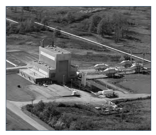
Aerial view of the Spacecraft Propulsion Research Facility, October 1999.

required. As explained by Les Main, GRC Historic Preservation Officer, these agencies understand and support NASA's reuse of our specialized facilities. The consultation process is required under the National Historic Preservation Act and is governed by an Agency-wide Programmatic Agreement executed in 1989. The consultation provides a means to ensure that unique engineering and architectural features of the B-2 test building are documented before they are altered or removed. It is a valuable exercise for a resource with limited public visibility. Documentation also provides a means of maintaining records of historic systems for future study by space system engineers and architects.