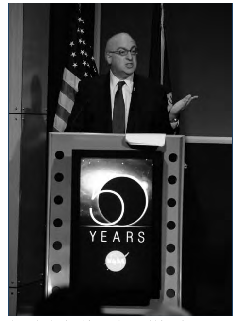
Conference on NASA's First 50 Years (continued)