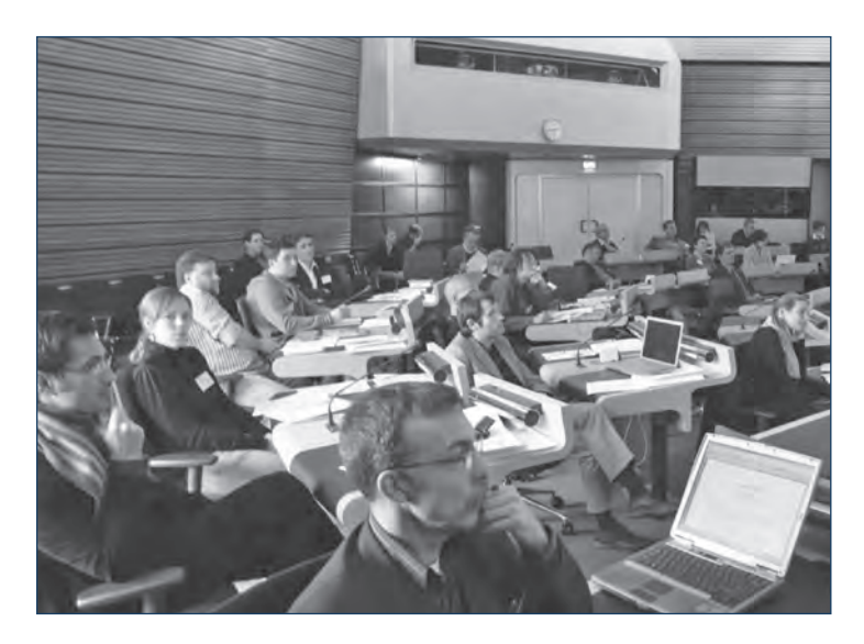
continued on page 6

Unlike NASA's successful "Societal Impact of Spaceflight Conference," held in September 2006 (see Proceedings at http:// history.nasa.govlsp4801-part1.pdf ),