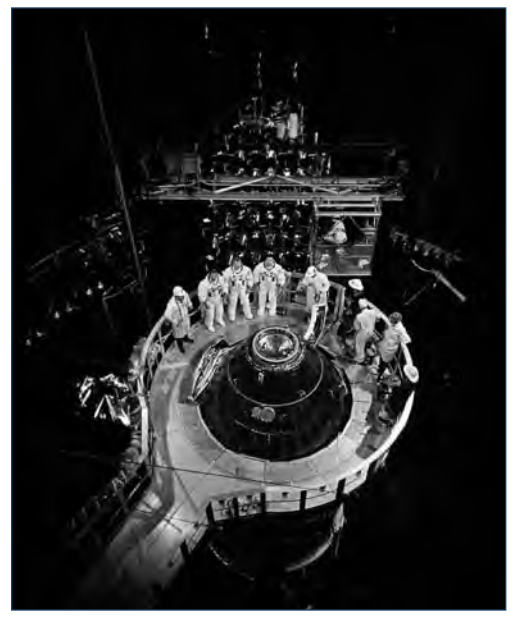
High-angle interior view of Chamber A showing three astronauts preparing to enter the Block II Thermal Vacuum Test Article in 1969. (Image Number S68-37430)

Compliance with the National Historic Preservation Act (NHPA) is required when projects, called