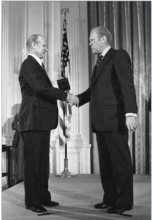
William H. Pickering receives the 1975 National Medal of Science from President Gerald R. Ford on 18 October 1976.

As a result of these efforts, many new, non-space-related projects ran in parallel with the ongoing NASA programs at JPL. These projects were funded, with NASA concurrence, by independent agencies. Projects in the fields of urban mass transportation, city government, education, law enforcement, and biomedics and solar energy are examples.