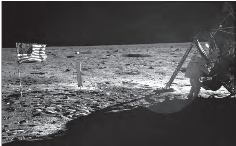
IMAGE IN SPACE HISTORY

Center: JSC • Center Number: AS11-40-5886 • GRIN DataBase Number: GPN-2000-001209