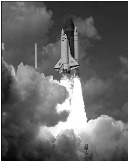
The Space Shuttle Atlantis , carrying the Galileo orbiter and atmospheric probe, lifts off from Kennedy Space Center on 18 October 1989.

Galileo represented a new phase in the study of the outer planets. The Pioneer probes and Voyagers 1 and 2 together completed the preliminary reconnaissance of those gas giants. But Galileo undertook a much more systematic, in-depth, and holistic analysis of the entire Jupiter system, featuring close flybys of its satellites and intense study of its particles and fields. And even before the spacecraft reached Jupiter, it visited Venus and two asteroids, and it twice returned to Earth, observing a spectacular celestial crash along the way.