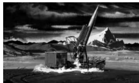
April 2006 Historical Photo of the Month from the JPL Archives Web site. This artist's rendering of a Sergeant missile on a mobile launcher originally appeared on the cover of a 1960 Sergeant brochure.

The year 2006 marks the 10th anniversary of the Historical Photo of the Month (HPoM) at JPL. A historical image is posted each month on the JPL Archives Web site and is directly accessible at http://beacon.jpl.nasa.gov/Histphotos/hpom/HistPhoto.htm . JPL Archivist