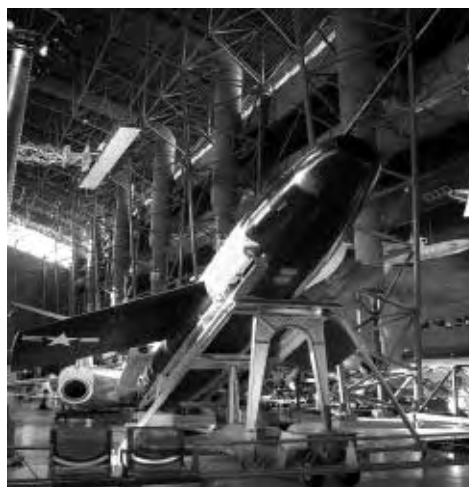
Mobile launching platform and Regulus missile at the Space Hangar at NASM's Udvar-Hazy Center.

In February 2006, NASM also acquired and placed on display a Viking 5C rocket engine, used to power the Ariane launch vehicle, a major vehicle built by a European consortium, into orbit. The donated engine, given by the SAFRAN Group of France, is now on display in the McDonnell Space Hangar at the Udvar-Hazy Center.