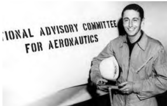
A. Scott Crossfield