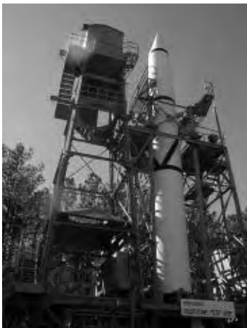
Historic Redstone Test Stand at the Marshall Space Flight Center.

After an engaging lunchtime presentation by James Hansen on his recent definitive biography of Neil Armstrong, First Man , participants were treated to a four-hour tour of the Marshall Space Flight Center. The tour included a visit to the Payload Operations and Integration Center, which coordinates all science payloads for the International Space Station, and to the National Center for Advanced Manufacturing. Among the most memorable aspects of the tour were visits to two national landmarks, the historic Redstone Test Stand and the Solid Rocket Motor Structural Test Facility, which was used to test clustered engines during the Apollo era, including the S-IB stage of the Saturn launch vehicle.