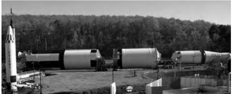
A Saturn V rocket on the grounds of the U.S. Space and Rocket Center.