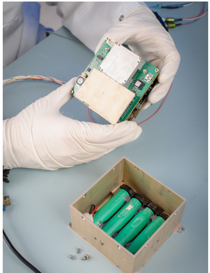
AVA Controller is smaller than a stack of 6 Compact Disc cases, and weighs in at under a kilogram - batteries included!

The AVA project is based at NASA Ames Research Center, Moffett Field, California. It is managed by the Engineering Directorate and is funded by the Space Technology Mission Directorate’s (STMD) Game Changing Development (GCD) Program.