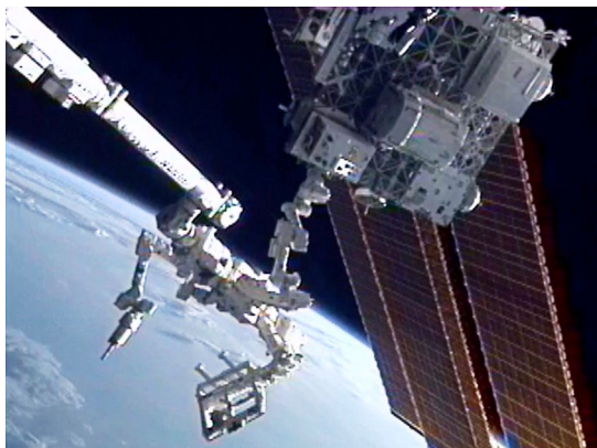
Dextre (center) practices a servicing task on RRM (above).

March 2012: RRM proved that remotely controlled robots and specialized tools can successfully perform extremely precise servicing tasks in space. An RRM tool at the end of more than 70 feet worth of teleoperated robotics cut wires the thickness of four sheets of paper with only millimeters of clearance.