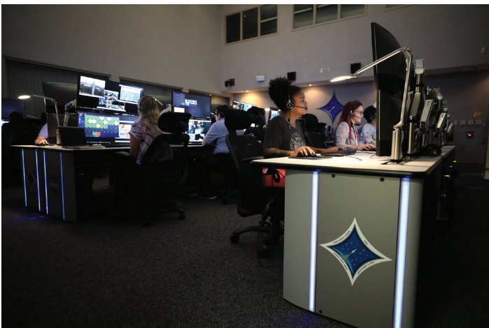
Inside Hangar AE's Launch Vehicle Data Center, NASA and contractor managers and engineers monitor progress of the countdown and liftoff of rockets that boost payloads to low-Earth orbit and beyond.