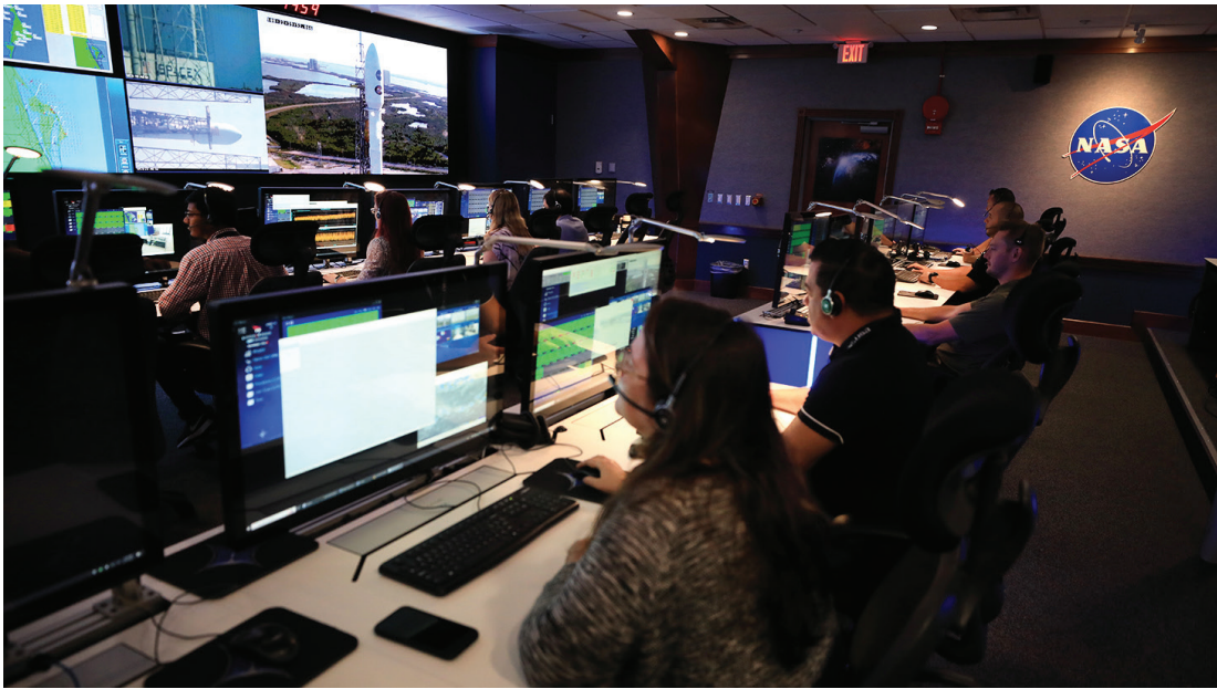
The Mission Director's Center (MDC) is a control room inside Hangar AE. Mission managers support ground testing and liftoff of launch vehicles from the MDC.

34-inch ultra high definition monitors which allow senior managers to see video, voice, and data all on one screen. With the modular design of the systems, the MDC can support missions at both Cape Canaveral Space Force Station on the East Coast and Vandenberg Space Force Base on the West Coast.