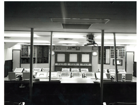
The expendable launch vehicle data station moved out of trailers into Hangar AE, establishing both the Mission Director Center and the Launch Vehicle Data Center.