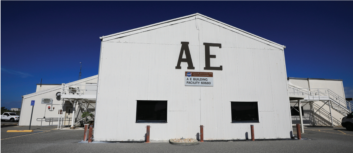
Hangar AE at Cape Canaveral Space Force Station in Florida houses control rooms providing real-time voice, data, and video information for expendable launch vehicle checkout and operations, and is used to support the uncrewed launch vehicle fleet.

Hangar AE, at Cape Canaveral Space Force Station in Florida, provides real-time voice, video, and data for vehicle checkout and launch operations. The building contains a Mission Director's Center, three Launch Vehicle Data Centers, a telemetry ground station, and offices for payload and contractor personnel. Services can be configured to concurrently support any uncrewed launch vehicles, making Hangar AE a crucial communication center for NASA's Launch Services Program (LSP).