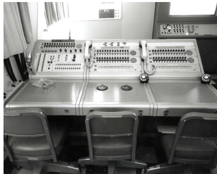
When the Vanguard project concluded, NASA took responsibility for supporting the Thor launch vehicle which was later renamed Delta. Support was provided from Hangar H and additional trailers.