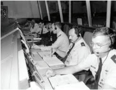
During 1956, prior to construction of Hangar AE, the Vanguard project was intended to be self-contained to the maximum extent possible. Its telemetry stations were located in trailers at the T-Pad, Hangar C, and later, Hangar S.