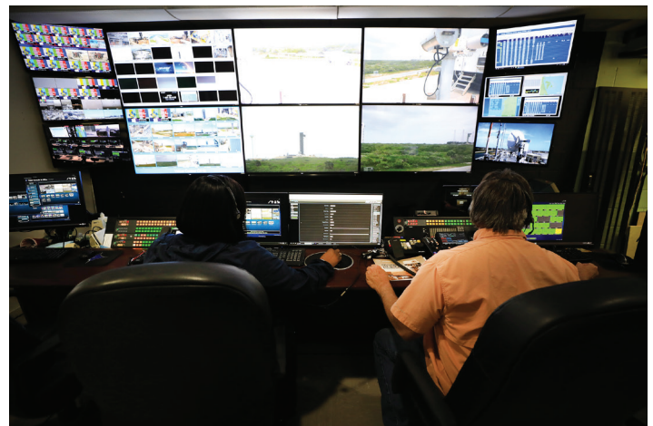
LSP Communication Engineers monitor the progress of a launch countdown in the Hangar AE Communications Room.