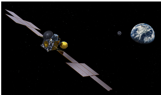
This artist's concept of a proposed Mars sample return mission portrays the Earth Entry System, bearing a container of Martian rock samples, heading toward Earth after separating from the Earth Return Orbiter spacecraft that carried the entry system and samples from Mars orbit to the vicinity of Earth.

The standards for safety engineering and containment being implemented for MSR are derived from "safety first" industries such as medicine and aviation. NASA and ESA engineers are focused on designing and delivering a multi-layered containment system capable of bringing Mars samples to Earth safely. The planned approach would provide higher levels of isolation than anything achieved previously in space flight, including for the samples of lunar rocks, comet dust, asteroids, and the solar wind captured and returned to Earth by earlier NASA and international missions.