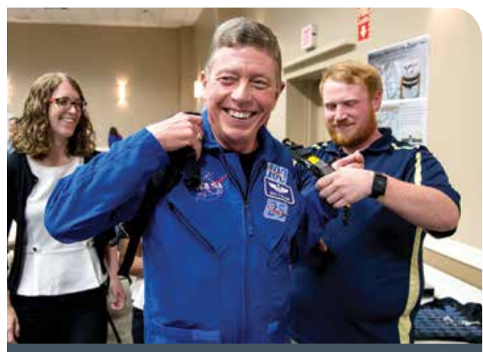
Astronaut Mike Fossum tries on a wearable haptic navigation garment developed for NASA by a Georgia Tech student team.

The idea behind the consortium is to expand and continue to collaborate with other schools across the country to develop new ideas for the interdisciplinary approach to wearable technology. By combining fashion and engineering, spaceflight apparel of the future will not only be well designed, but eminently functional.