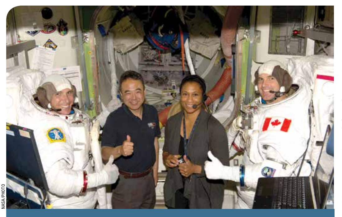
The astronaut quartet spent the first day of Space Week preparing for their simulated spacewalk in the Building 9 Quest Airlock mock-up.

"Even when crew members prepare for an EVA, their workdays may still