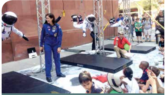
NASA astronaut Nicole Stott interacts with the next generation of potential explorers.

As the festival led up to the 50th anniversary of the first American spacewalk, exhibits focused on engagement through the science, technology and careers represented by the spacesuit. In addition, the International Space Station Program offered insight into the vast array of science activities being conducted daily that directly benefit life on Earth. There were a number of additional activities offered by NASA, including the music our satellites make in space at the Orbit Pavilion and stargazing opportunities at Brooklyn Bridge Park with a